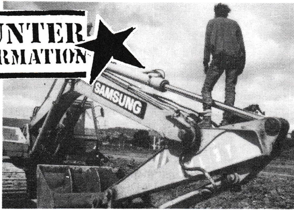
Anti roads protestor stops digger at Solsbury Hill, Bath.