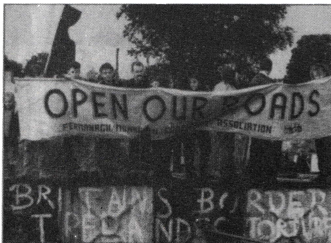
Villagers celebrate the premature — and short-lived — reopening of a cross-border road

The full version of this can be obtained from POB 1528, Dublin 8 or via e-mail an64739@anon.penet.fi Read an alternative view in Organise, magazine of the A.C.F.. Send large SAE for sample, address on p.4.