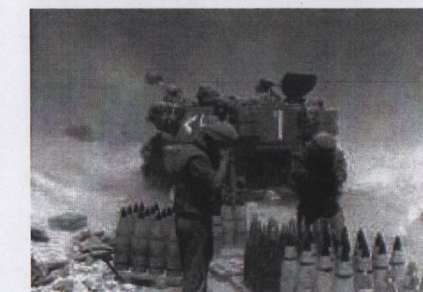
Israeli tank shelling positions inside of Lebanon

On the 12th of July the Lebanese militia group Hezbollah executed a raid on an Israeli army patrol in northern Israel, killing a number of Israeli soldiers and capturing two others. The raid occurred whilst other Israeli units continued their attacks on targets in the Gaza Strip following the abduction of an Israeli soldier by Hamas. During Israel's incursions into the Gaza Strip they demolished bridges, Gaza's main