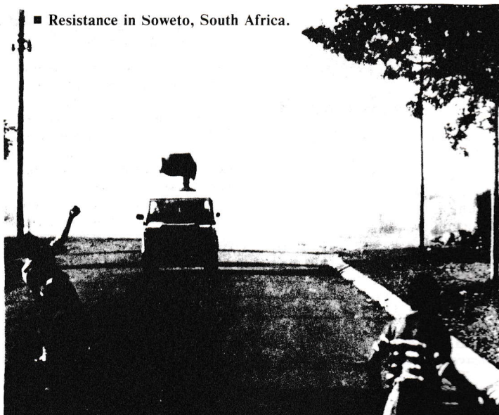
■ Resistance in Soweto, South Africa.

Centro Documentazione Proletaria, Via D'Aquino, 158 1.p, Taranto, Italy.