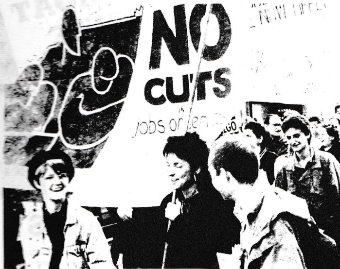
■ Marching against the cuts in Haringey, London.