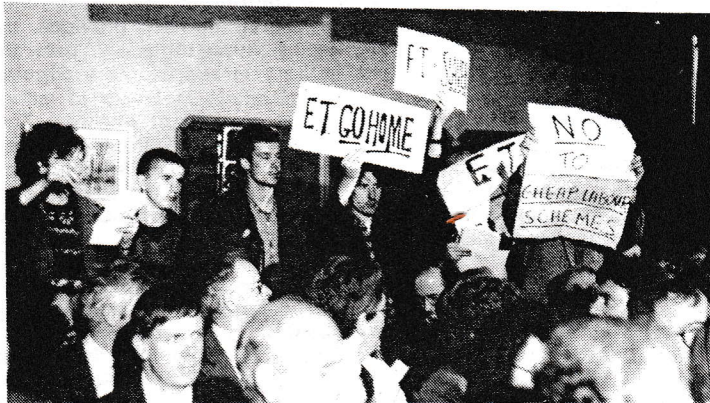
SHOCK.....HORROR..... how did THEY get in? Consternation for the bosses as anti slave labour protestors disrupt the launch of the Employment Training Scheme at the Crest Hotel, Edinburgh, on 1st September.