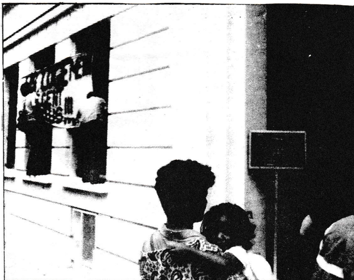
Homeless people take over the government OPHLM building in Paris on 22nd June.