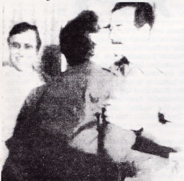
HISTORIC EMBRACE: Kurdish leader Jalal Talabani embraces Saddam Hussein on Iraqi TV.

Faced with these proletarian uprisings the various bourgeois interests in the region had to suspend hostilities and unite to suppress them. It is well known that the West, led by the USA, have long backed Saddam Hussein's brutal regime. They supported him in the war against Iran.