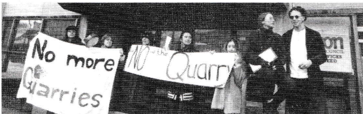
Anti-Quarry Demo outside Avon Council, Bristol Jan'95.

3 Nights of disturbances at Luton's Marsh Farm estate were provoked by the arrest of a 13 year old on 4th July. Riot cops moved in as road blocks involved 500 young people angry at their situation & prepared to greet the cops with molotov cocktails & other missiles. Three schools got torched as the riots dragged on for successive nights. As one of the youths said: IT's a good way to liven up these hot summer nights". Bradford 1 - Luton 1, Whose next ?