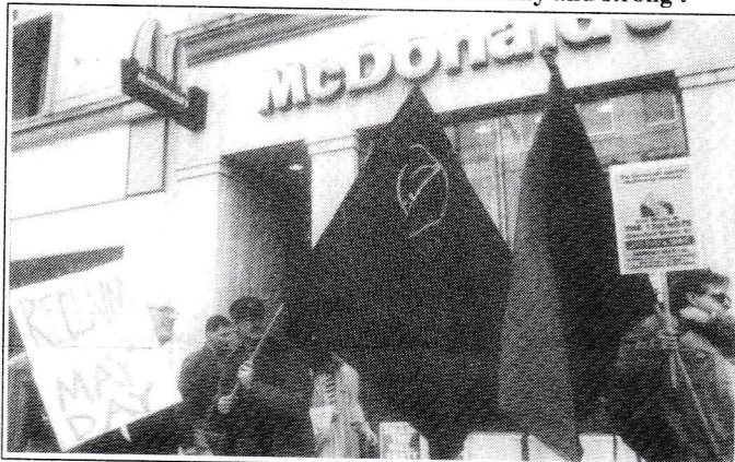
A Scottish Federation of Anarchists (0141 226 5066) demo-May 1st in Sauchiehall St., Glasgow.