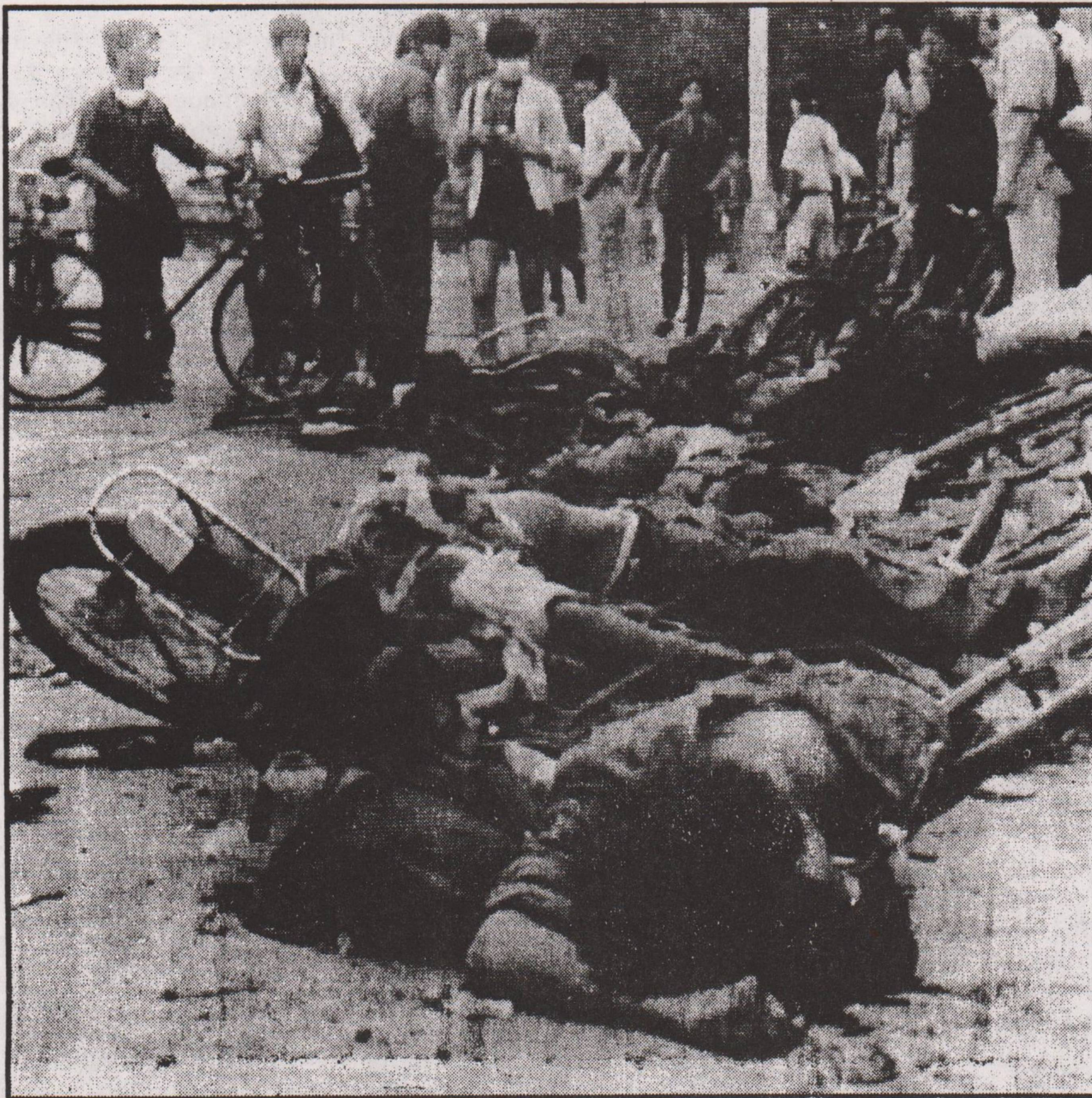
Dead students lie beside their crushed bicycles near Tiananmen Square the morning after tanks and troops moved in

As we write almost twenty four hours after the attack the city is still in utter chaos with hundreds if not thousands of vehicles blazing and the streets littered with the dead. Tonight reports say that there have been mass demonstrations in support in many cities throughout China, specifically in Wuhan, Changsha and Shanghai. In Hong Kong 200,000 plus staged protests outside the Chinese government buildings, some attempting to storm it. There seem still to be hundreds of thousands on the streets of Peking confronting the