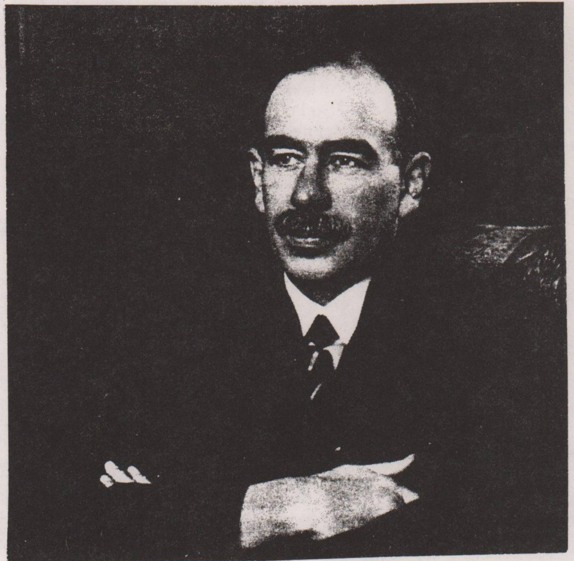
Keynes in 1929

capitalists) but with the approval of the state. By the mid 1930s the state decided that it was strategically important to begin subsidising shipbuilding. A similar pattern was to be found in the coal industry. In this instance coal owners showed great reluctance to reorganise themselves (a legacy of the particulars of British Economic development). Voluntary schemes instituted by the state were rejected or ignored by the owners and in 1938, in the face of opposition from private capital, a bill was introduced to Parliament which would have forced reorganisation upon the industry. Of course all this was being done in the light of Keynes General Theory (1936), a work which guided not only forms of industrial reorganisation but also social intervention. Schemes for control of the unemployed were instituted; Distressed Areas policy was pursued. Control of the unemployed was carried out before Keynes major work but his General Theory focussed upon the causes (as the bourgeois economist saw them) of "distress" in the economy and thus became an important factor in constructing an ideology for policing the working class, for of course, global policing was via the military. Rearmament was undertaken by the state from the mid 1930s.