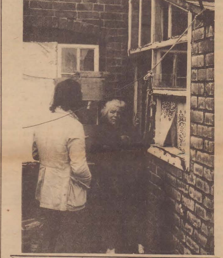
Despair and Disrepair - Coventry council housing 1979.

Meanwhile the campaign to change these discriminatory housing policies is to be to be stepped up. Following the attempts of the