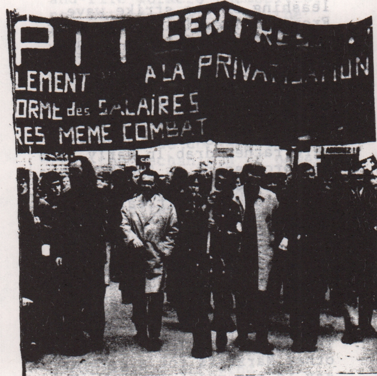
CNT POSTAL WORKERS DEMONSTRATE IN LYONS.