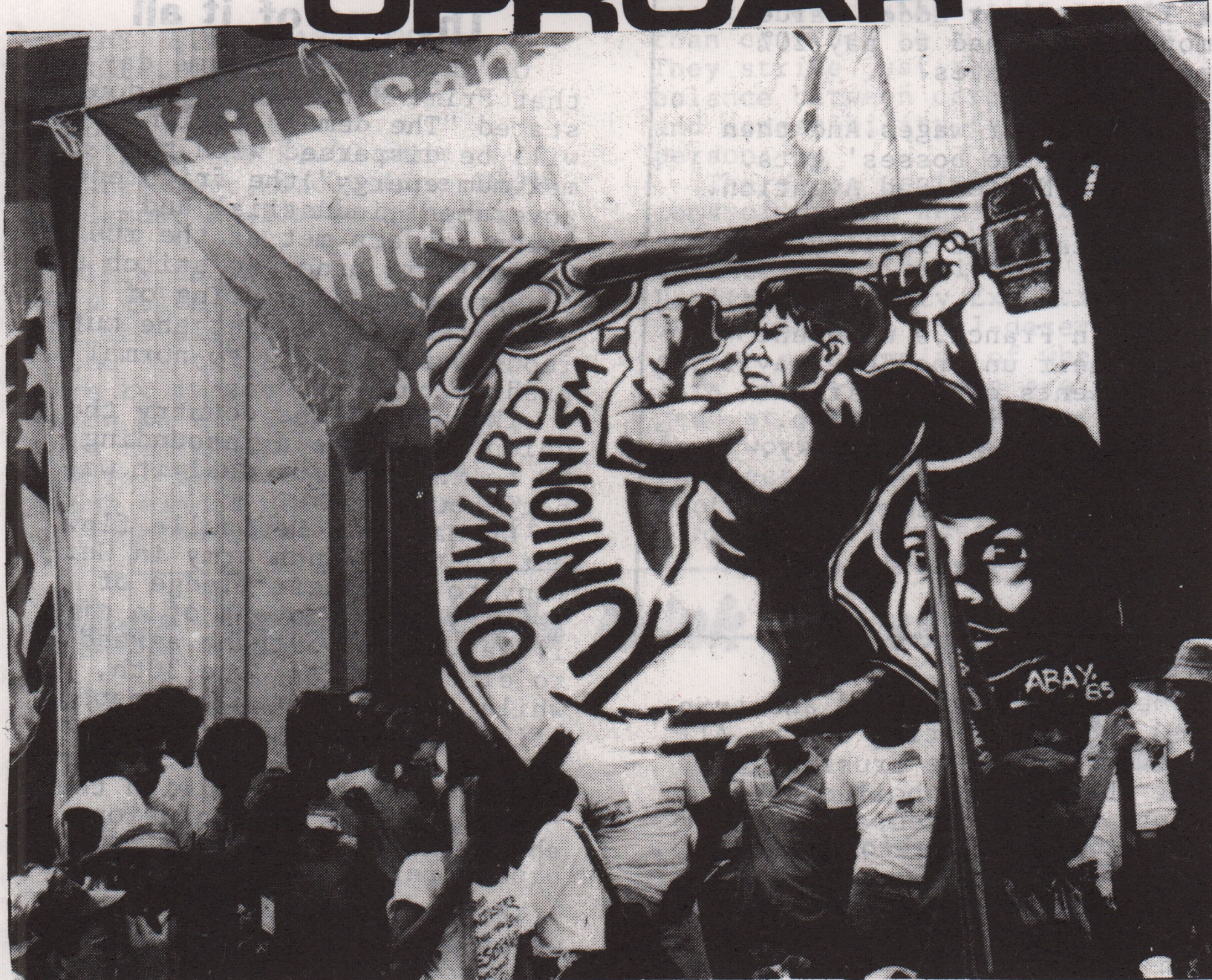
May Day '85 the message is clear. The KMU march despite government bans.

Before it even began, nobody could have been under the illusion that the Philippines election would be run in the same way as our so-called "free, fair and democratic" elections (where the voters themselves rather than the votes are manipulated, but at least the counting is accurate).