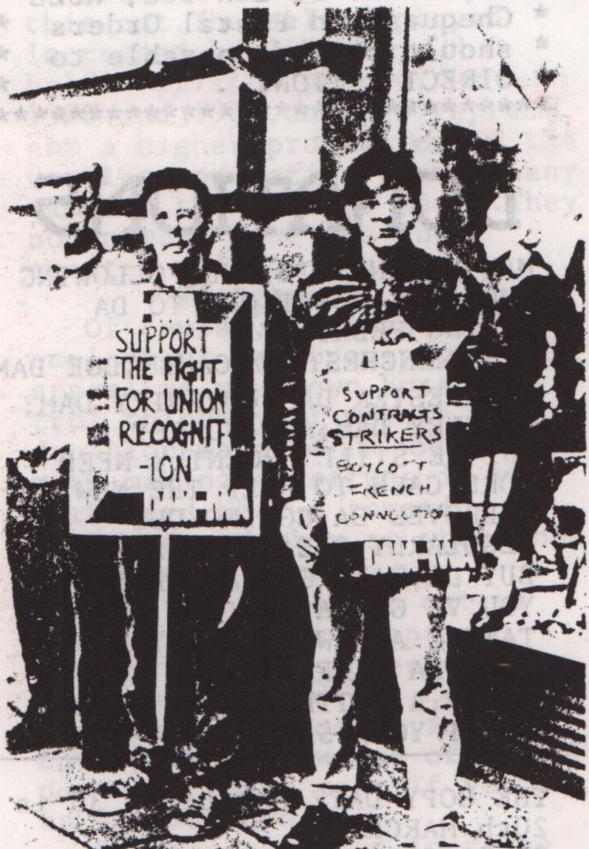
DAM MEMBERS PICKET FRENCH CONNECTION IN MANCHESTER.

Letters of support and donations to: NUTGW, 18 Norfolk St, Sunderland, Tyne and Wear.