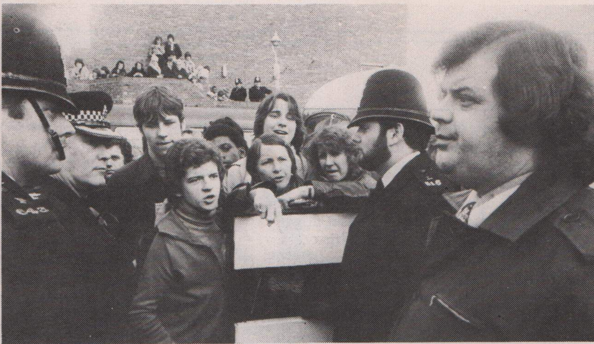
A PETULANT MARTIN WEBSTER, decidedly put out by the jeers of local kids, arrives at Longbridge School, Brixton, for a National Front election meeting. Many people had spent the morning leafletting houses in the constituency, warning residents of the potential threat from the Front, and attempting to give support and encouragement to black people in the area.

The National Front have been prevented from establishing a presence on the streets in Croydon,