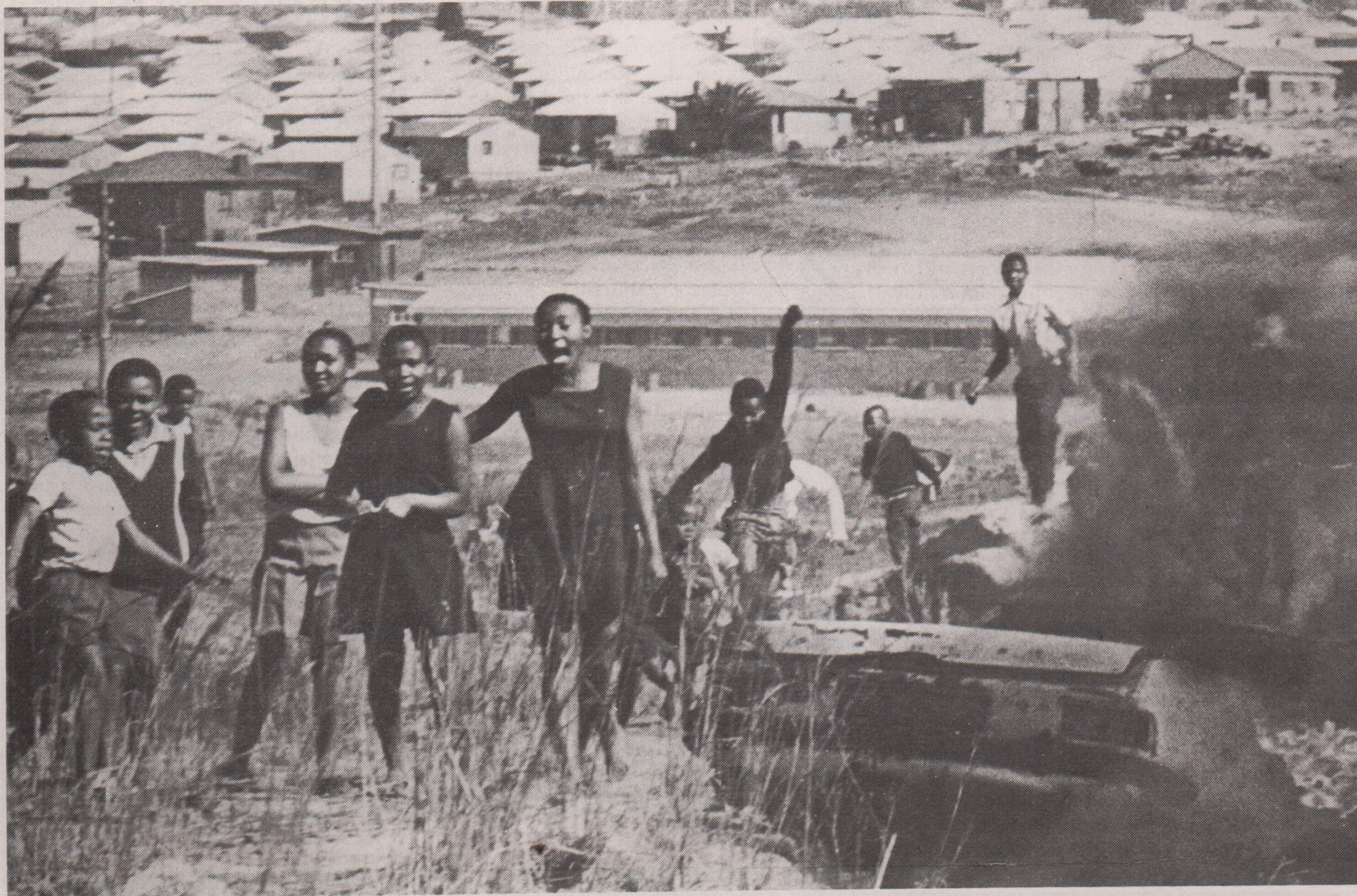
Soweto schoolkids, August 1976. The riots were followed by a harsh repression.

then worked for a given period and then cleared off again.