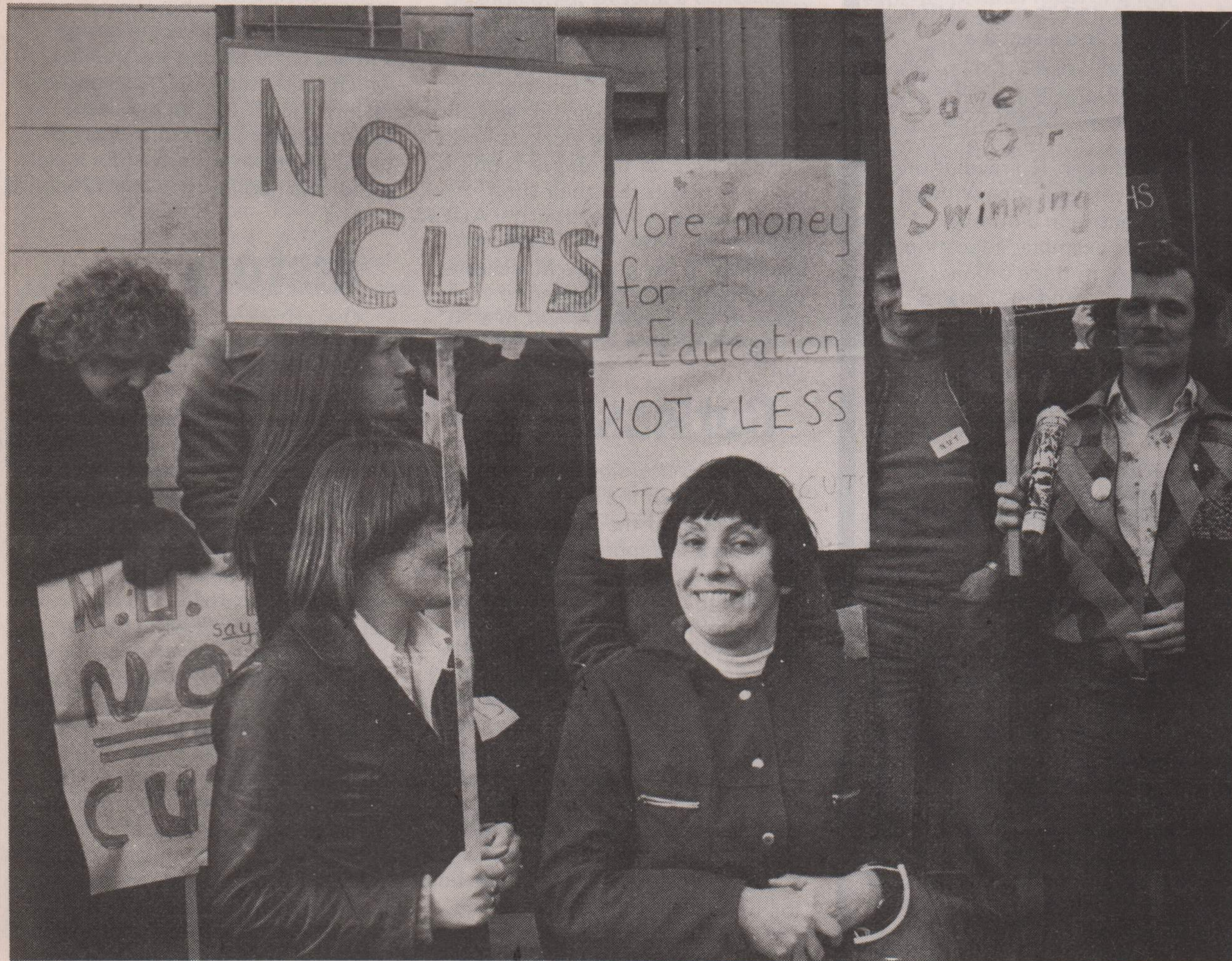
Manchester NUT protest against cuts.

We were very disappointed at the lack of response from other unions. Representatives from NALGO and COHSE have turned up occasionally, but the committee has really been held together by NUPE and NUT. So although meetings have been useful in comparing experiences and monitoring the cuts we have not had the resources to organise a full scale campaign against the cuts.