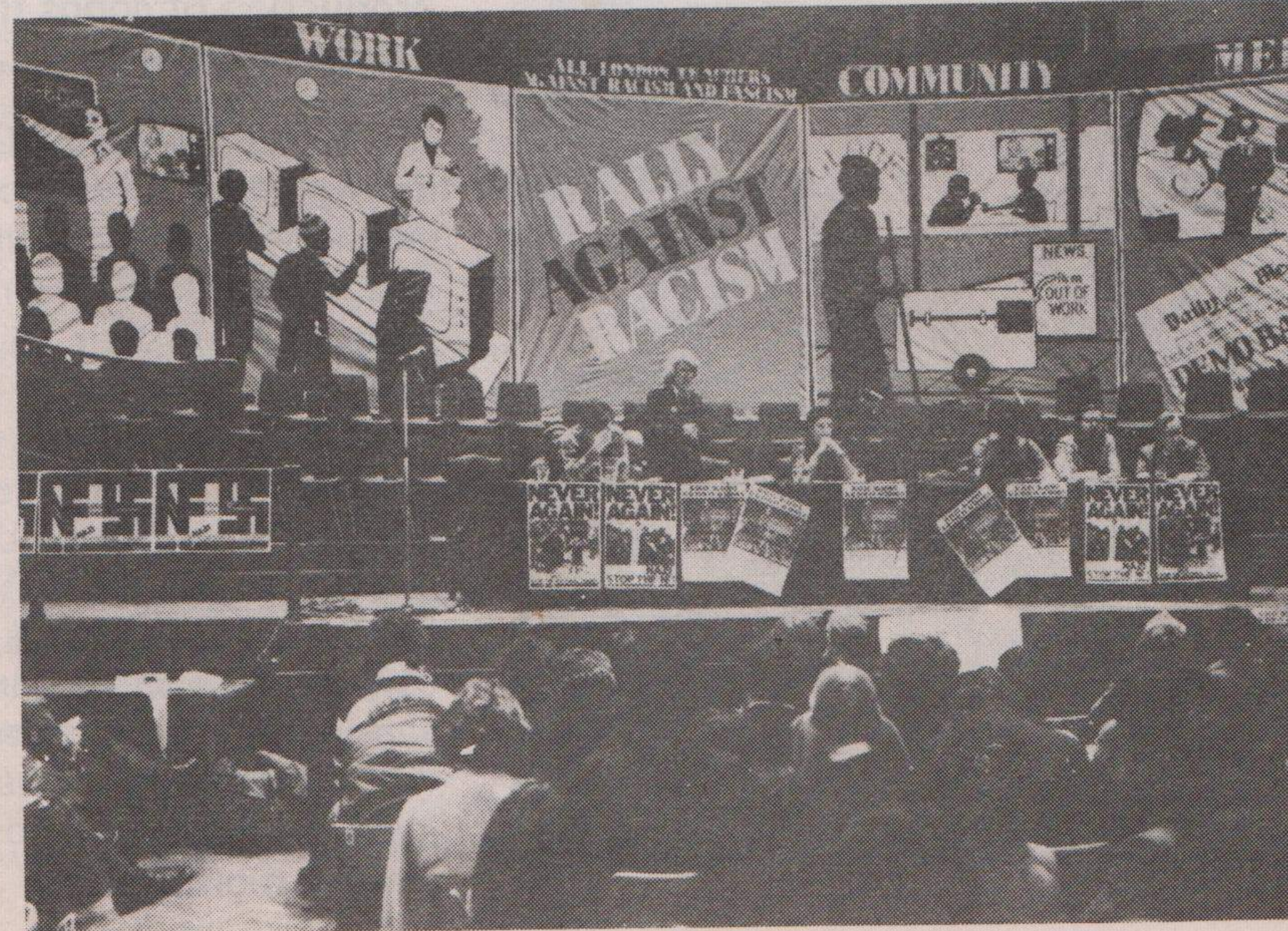
Teachers Rally Against Racism