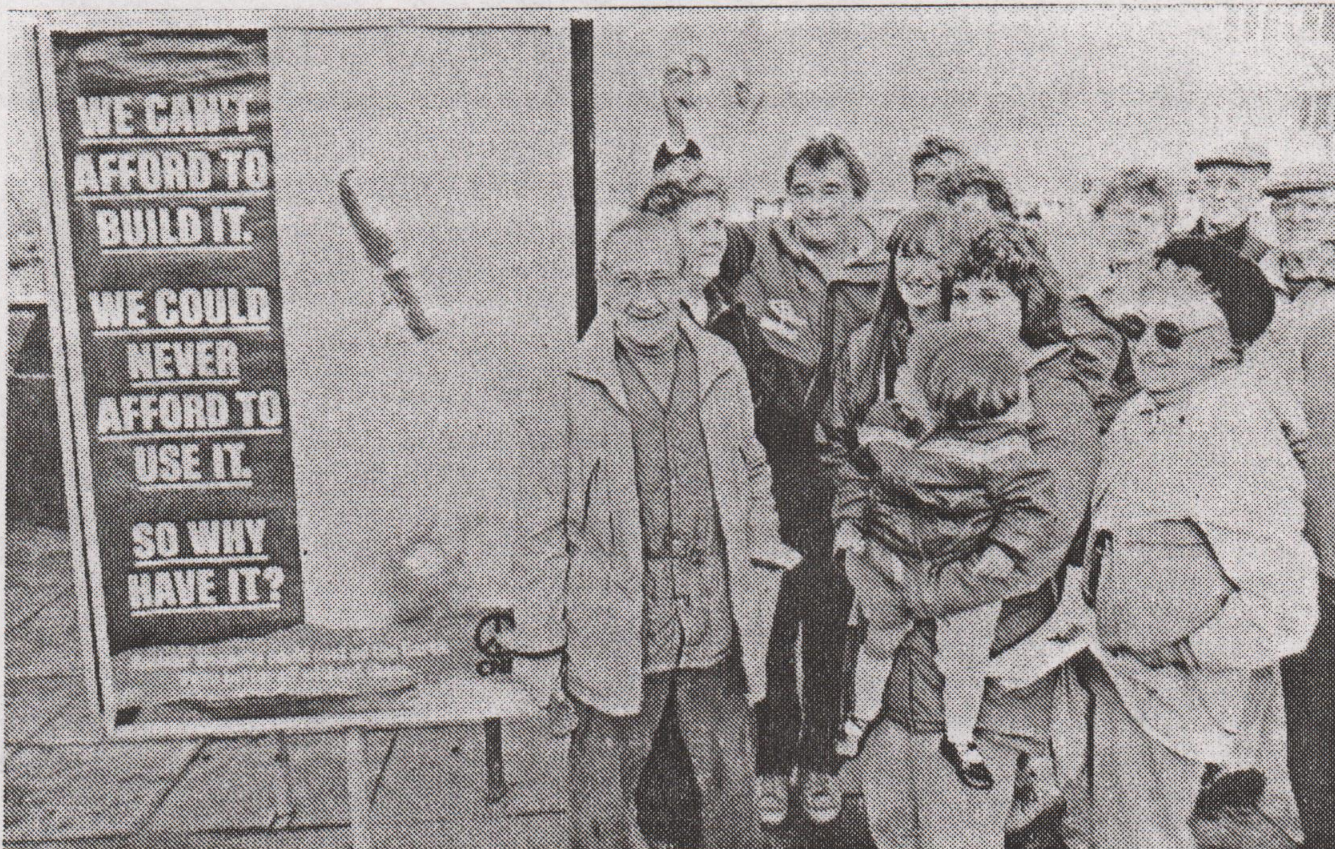
BRIAN CLOUGH with NCND members in West Bridgford by one of our eight billboard posters.