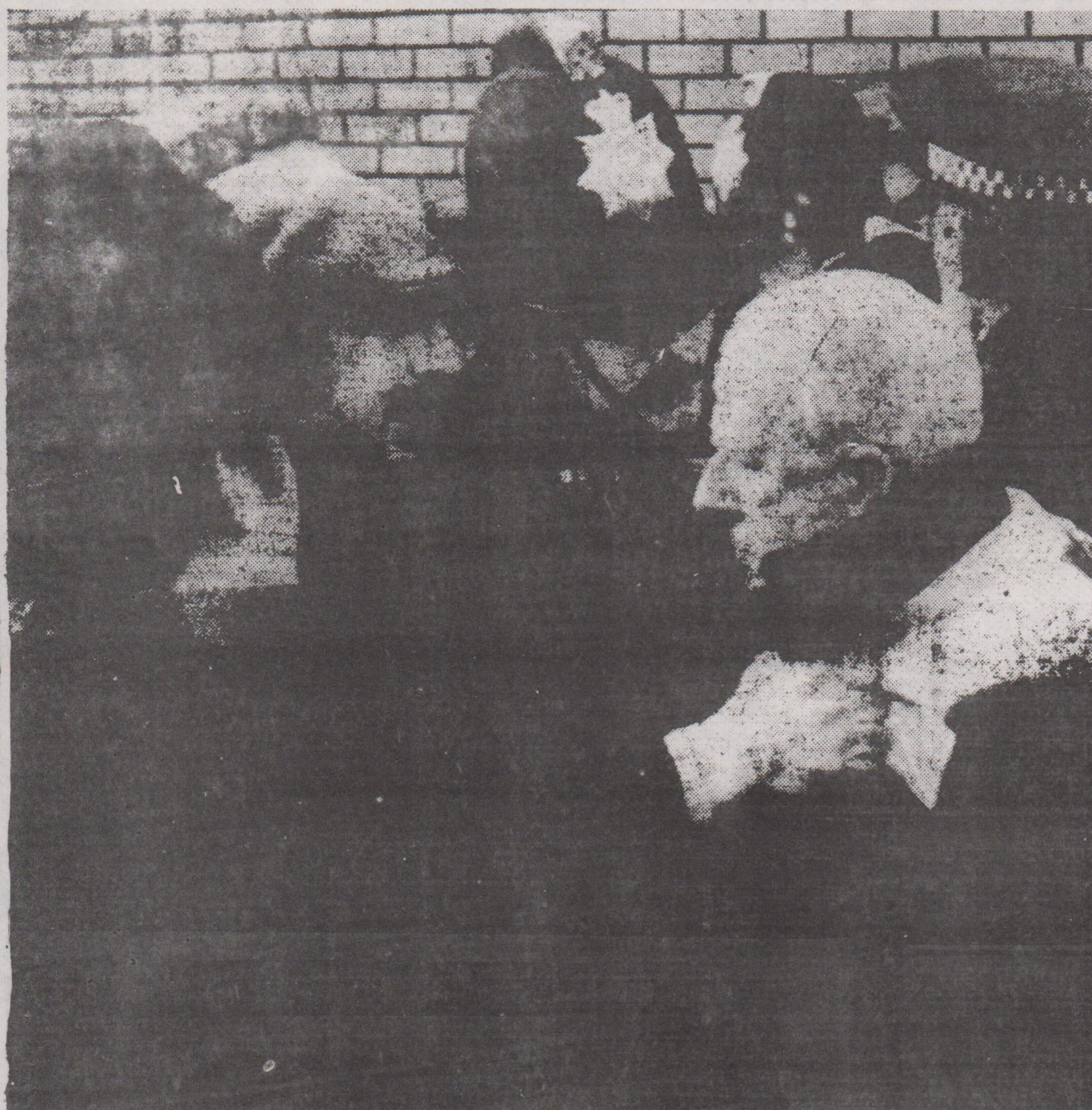
FACE TO FACE: A miner grabs hold of Coal Board chairman Ian MacGregor's coat.