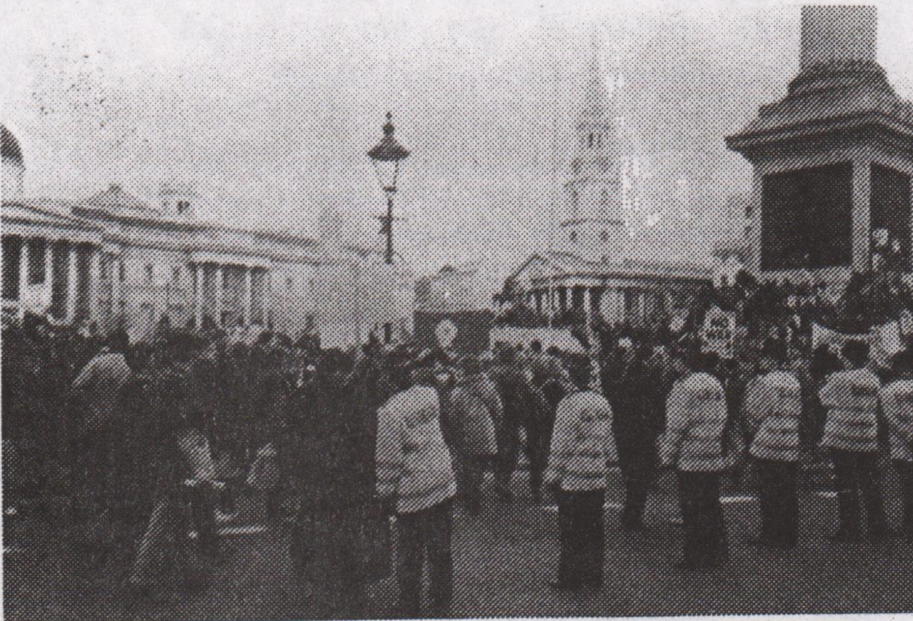
On arrival at Trafalgar Square to hear the speakers, the movements of those attending were severely restricted by the police cordon.