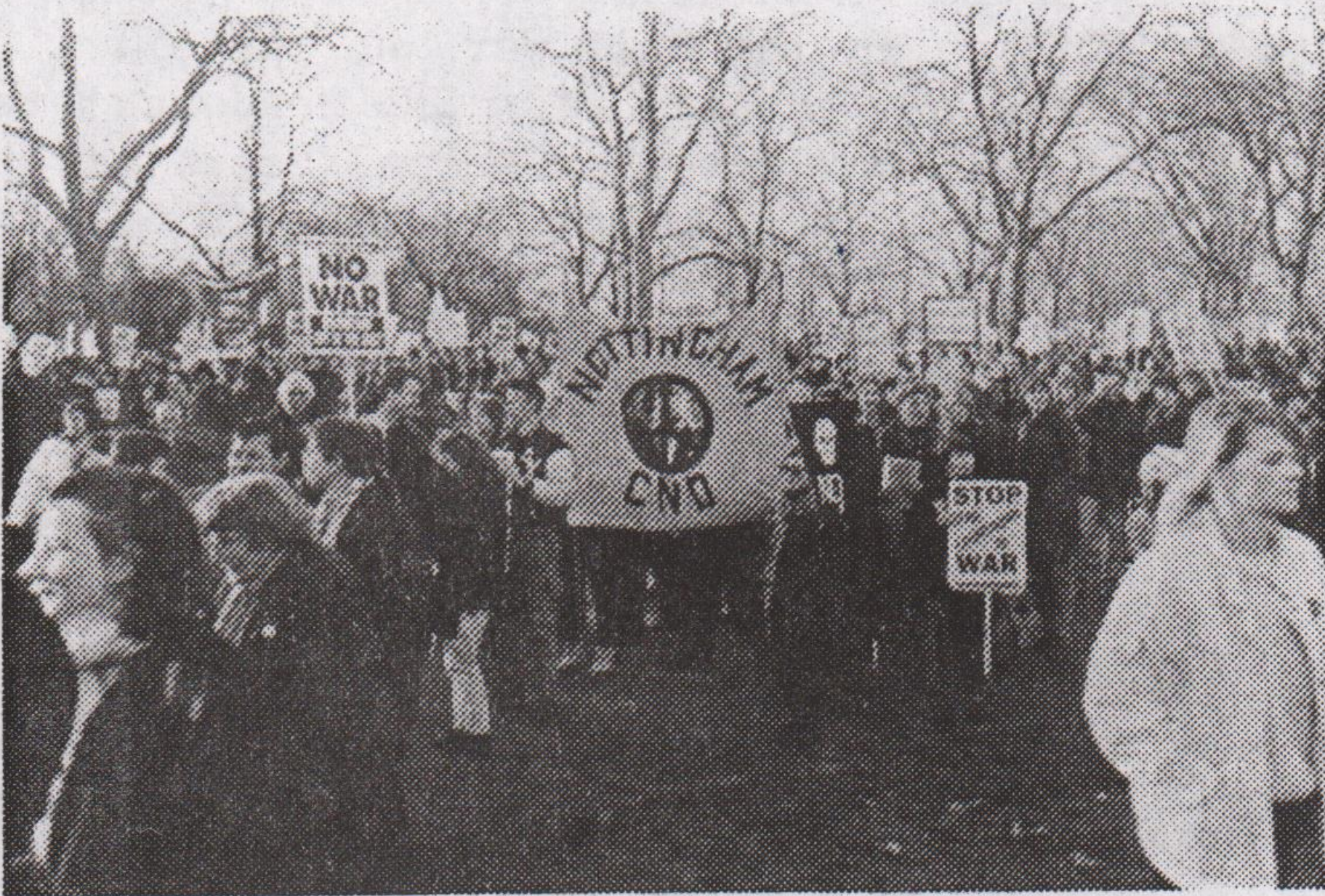
Jan. 12th - Hyde Park. Nottm CND members' long, long wait to set off.