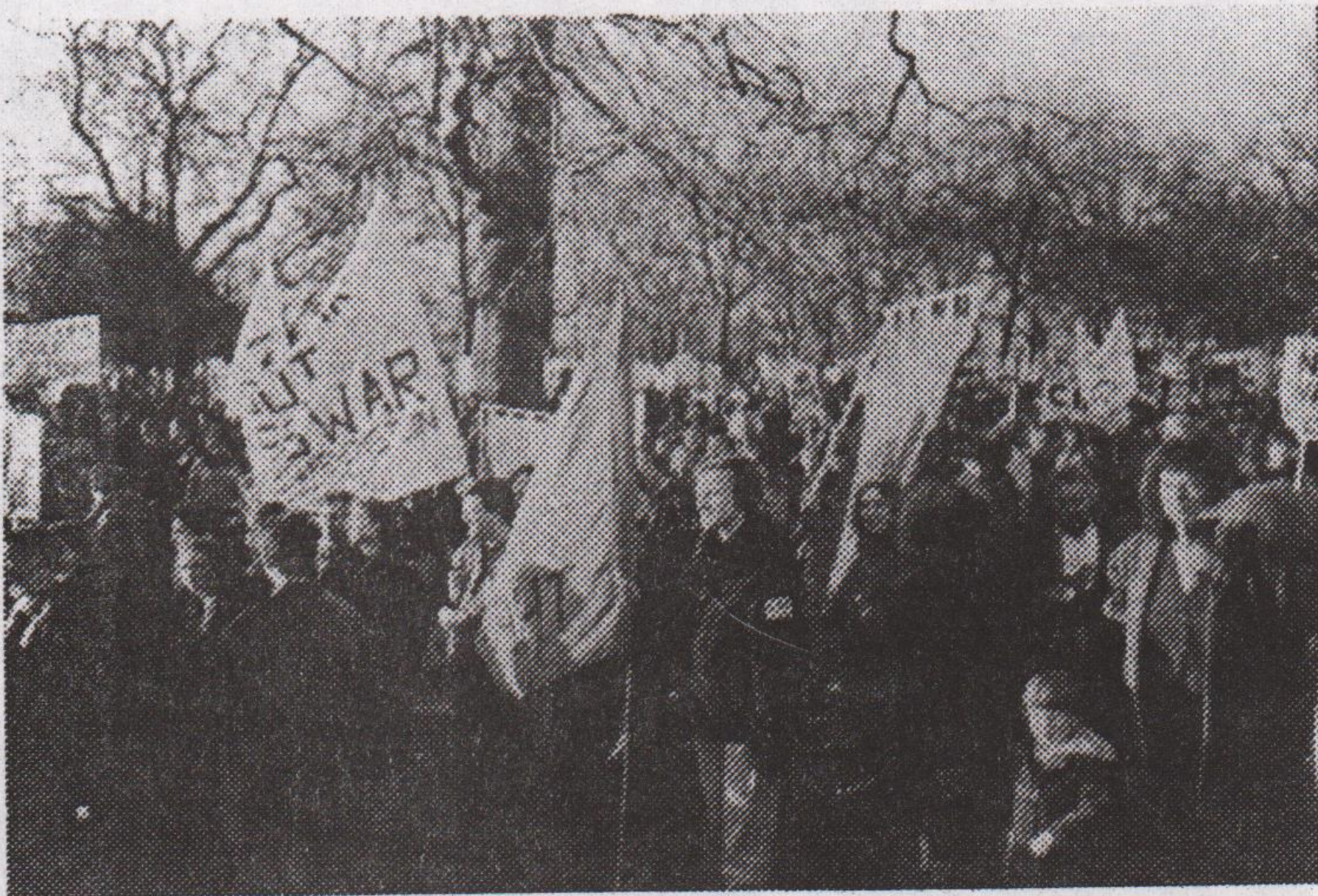
Some of the thousands waiting to leave Hyde Park.