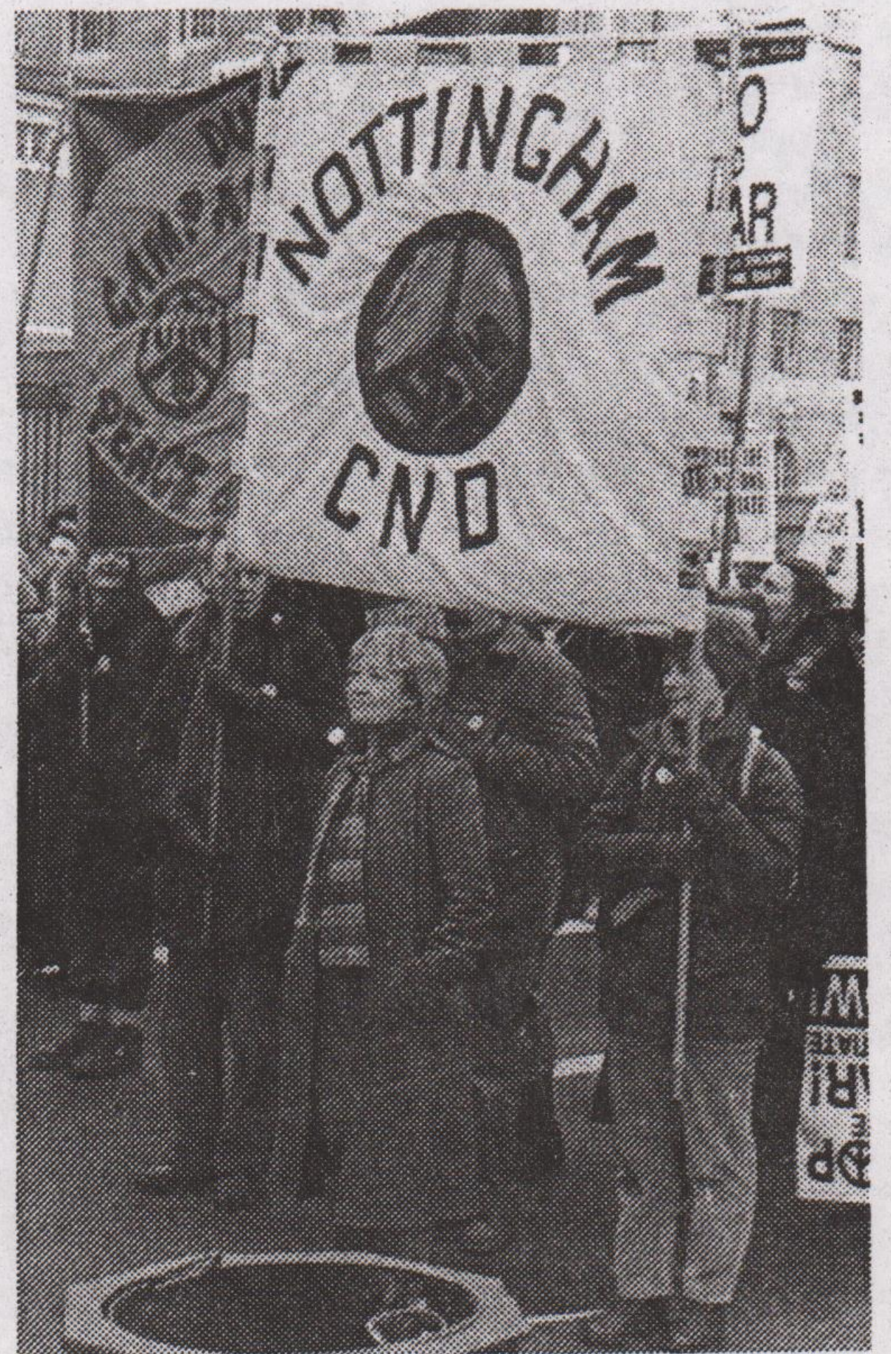
Feb 2 - London march.

NOTE: Details of forthcoming events locally and nationally are available by phoning NCND office at any time (24 hour ansaphone) Tel Nottm 588586