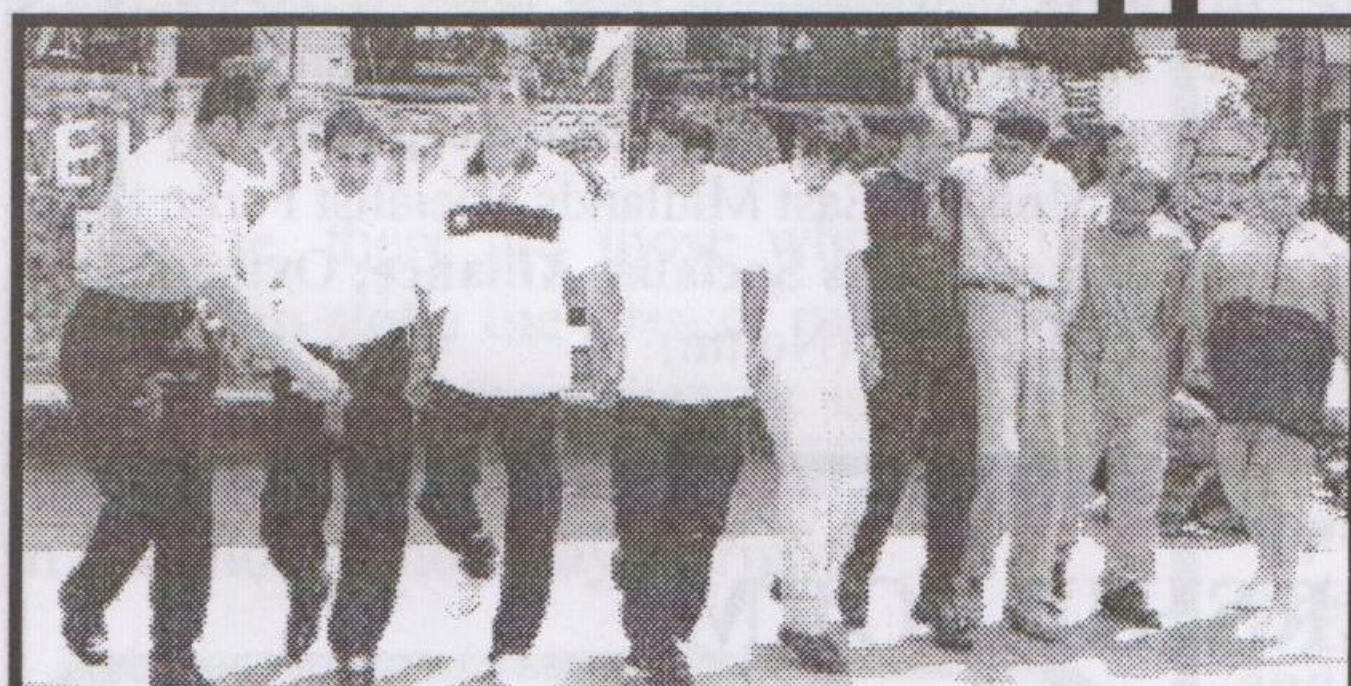
KURDISH DANCERS IN THE MARKET SQUARE DURING REFUGEE WEEK