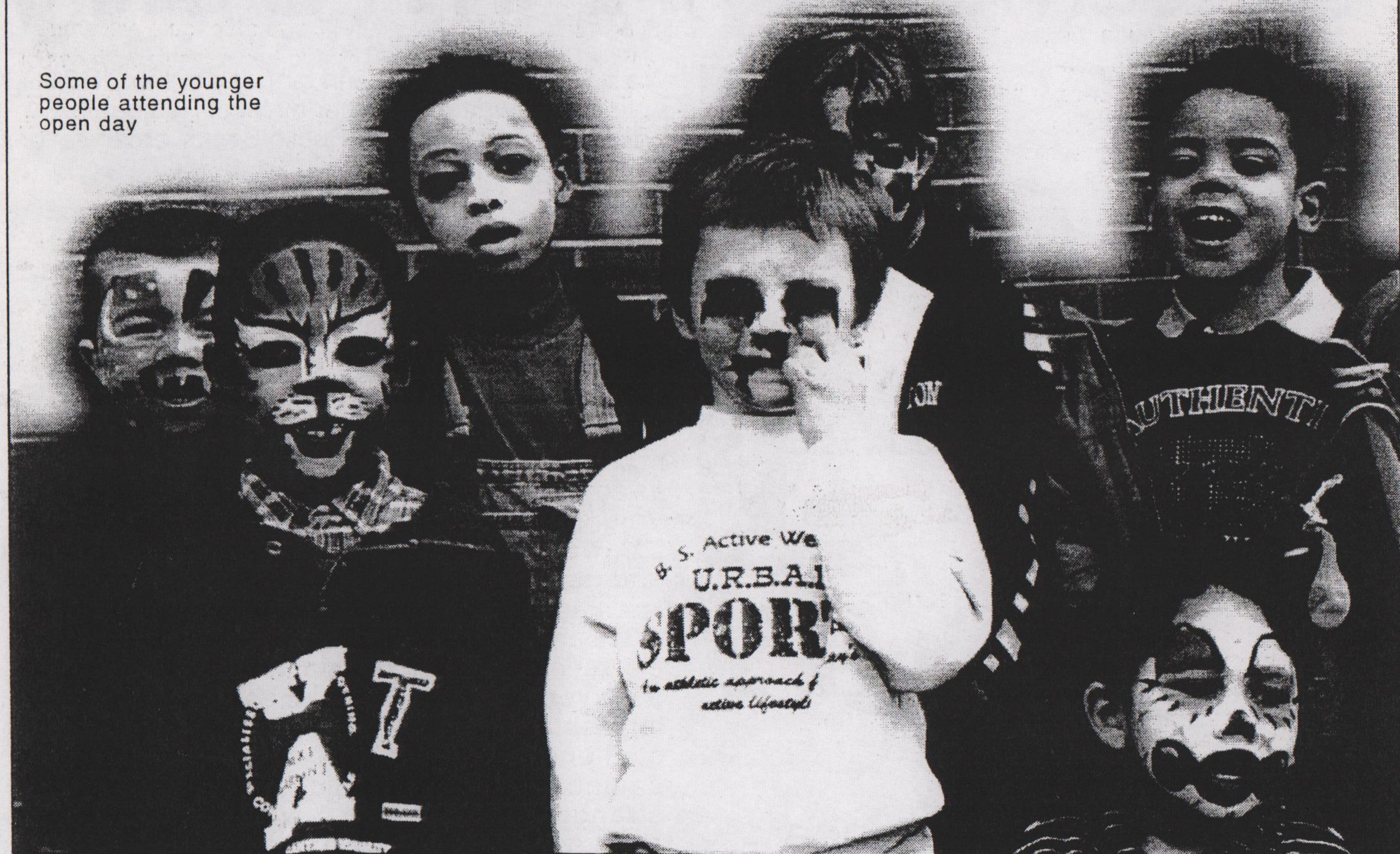
Some of the younger people attending the open day