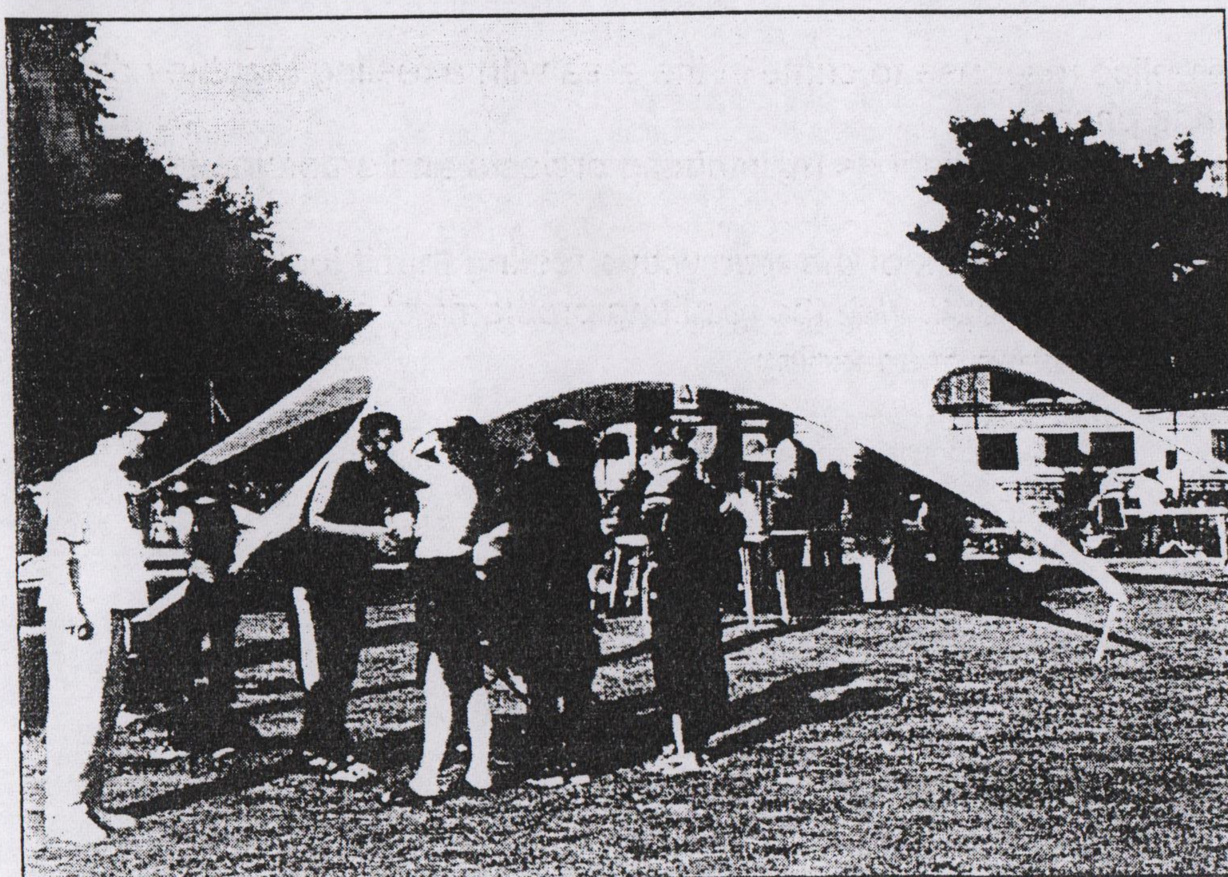
Consultation session, under a big tent, for the 'World Garden' idea for Independent Street site in Radford. Held on the 23rd August with over 60 local people attending.

On September the 16th there will only be 99 shopping days until Christmas 2000! and less than 465 shopping days until Christmas 2001!! For those who celebrate Christmas - time to panic! For those who don't its time to watch the shops fill up with rubbish. For those who aren't sure it's time to make a decision.