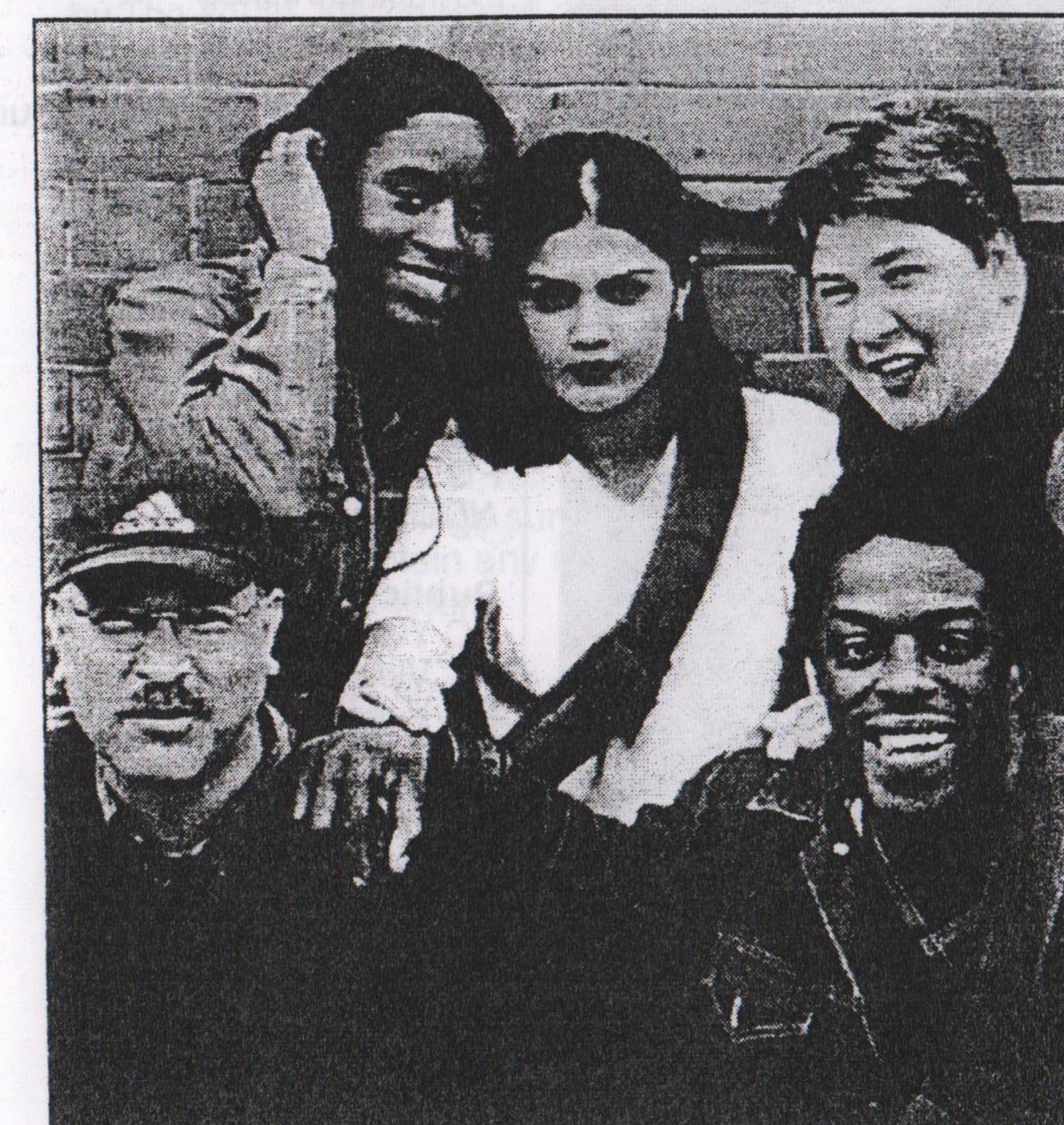
One of the URBAN Projects - the URBAN Youth Team. (A couple of issues back we had a rather poor photo of the Urban Youth project team. Here we have a much better pic so there's no excuse not to recognise them.)

*Key Fund (grants scheme). *Accreditation of Prior Learning Experience. *Community Safety Coordinator. *Urban Illuminations. *Community Justice Project. *Anti Racist Manual. *Cultural Awareness in Housing. *Participation in Decision Making. *Learning Legacy (staff and grant scheme with over 190 Grants [as of June 2000]).