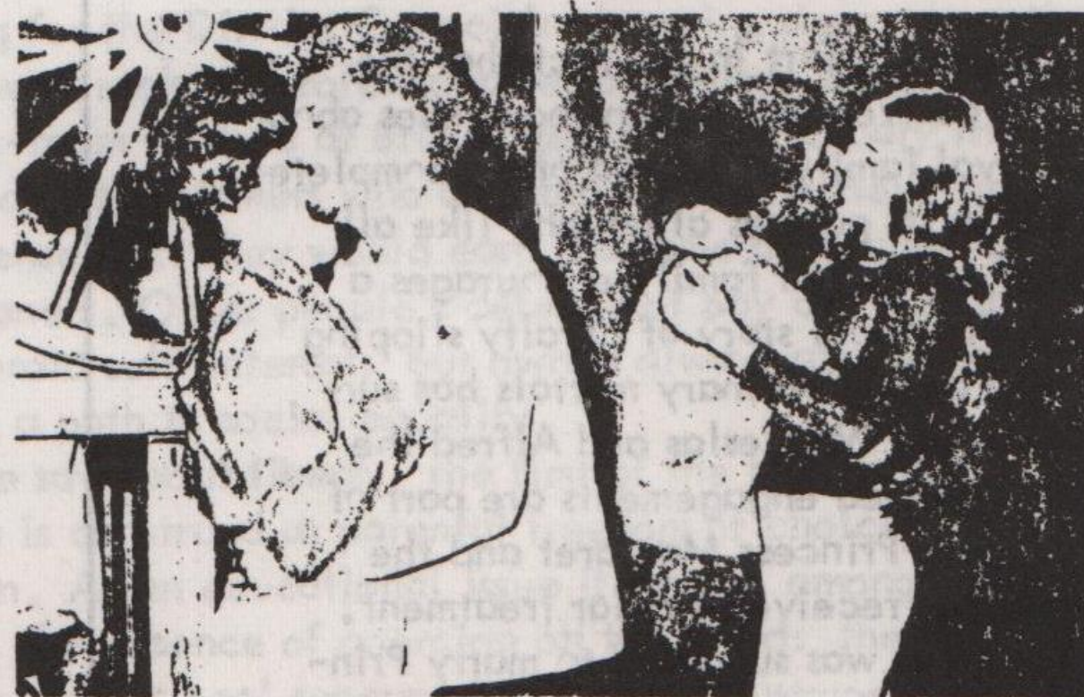
The result of forced busing

FORCED BUSING WILL RESULT IN A RACE OF MULATTOES