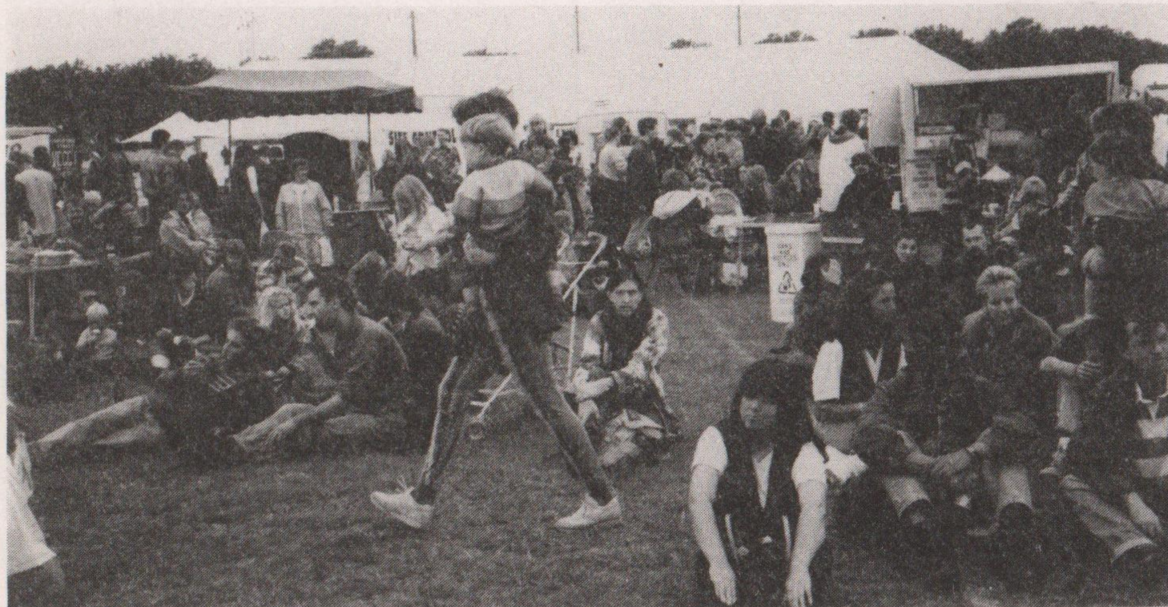
People enjoying the Nottingham Green Festival

The organisers of the Green Festival are considering expanding next year's event, perhaps to go on into the evening.