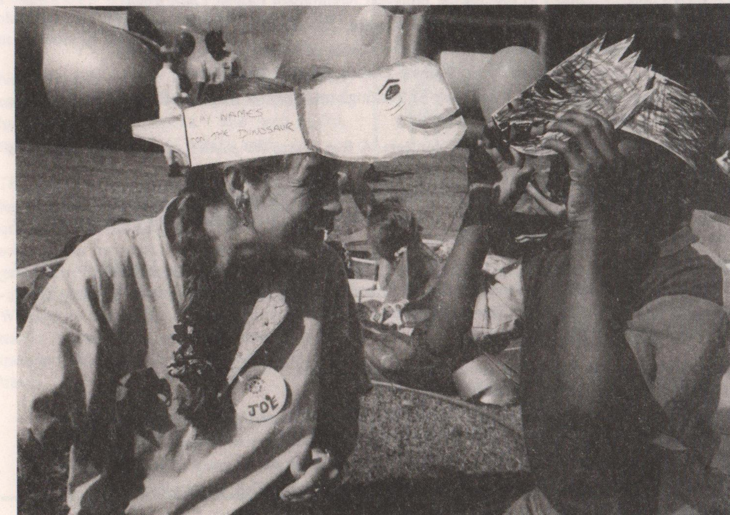
Playworks scrap in use at Sneinton Streetplay in August