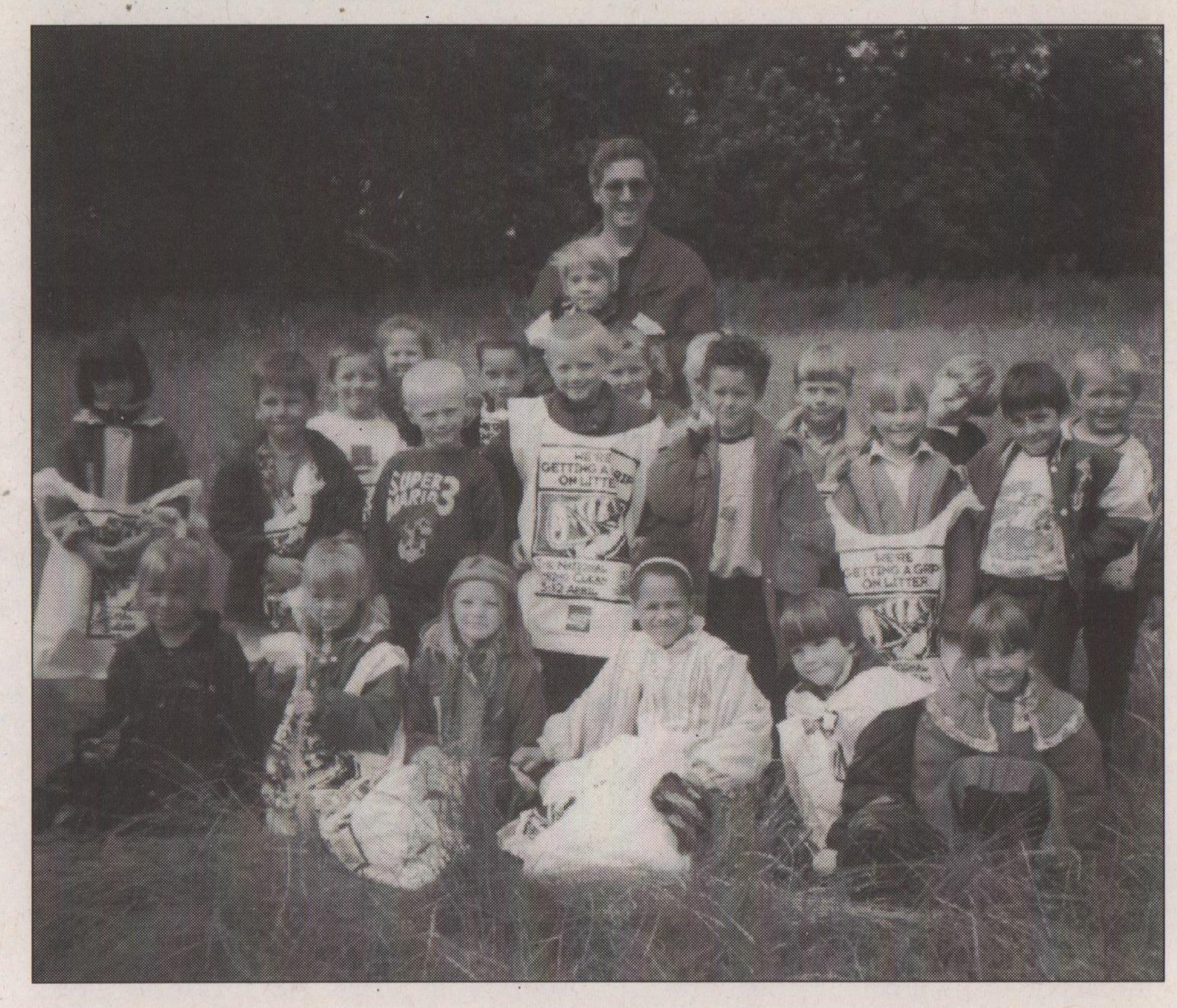
Pupils from Springfield Junior doing a litter-Pick in Bulwell Hall Park in April.

Our members do not just include WI members we have quite a few men who work in a variety of occupations, and also some who are retired. If anyone is interested in the group they will be made very welcome.