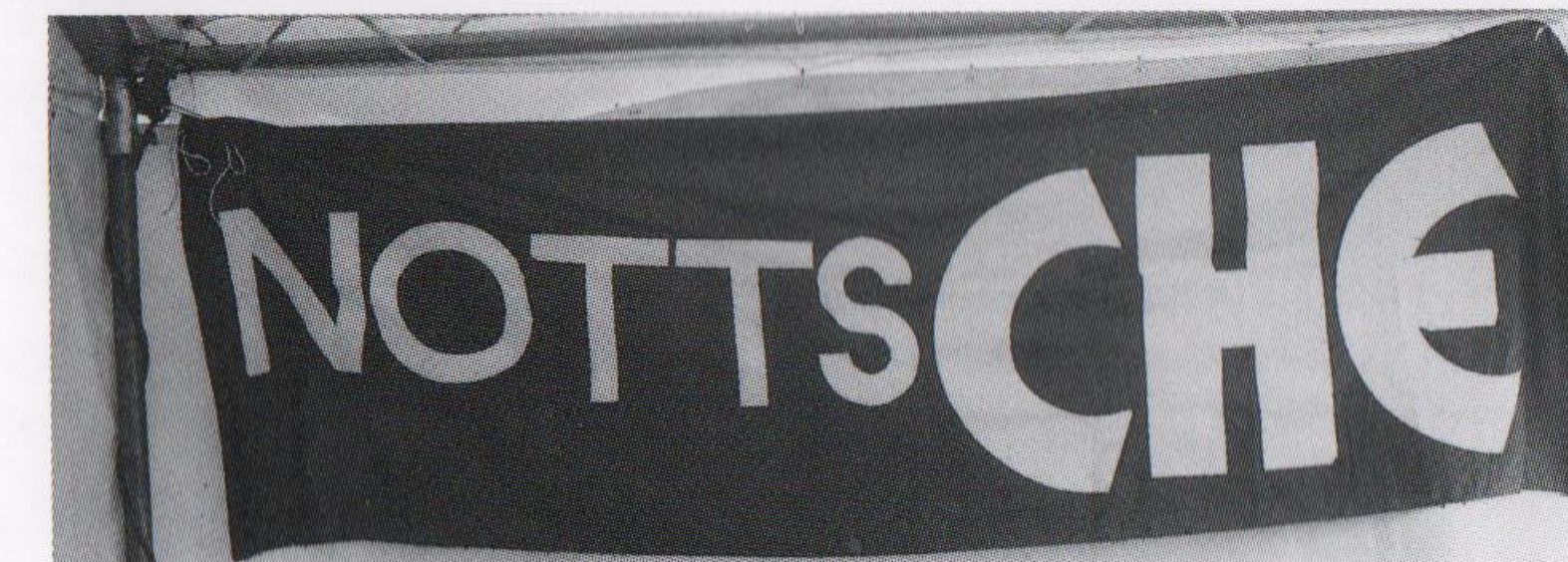
A Notts CHE banner from the 1970's