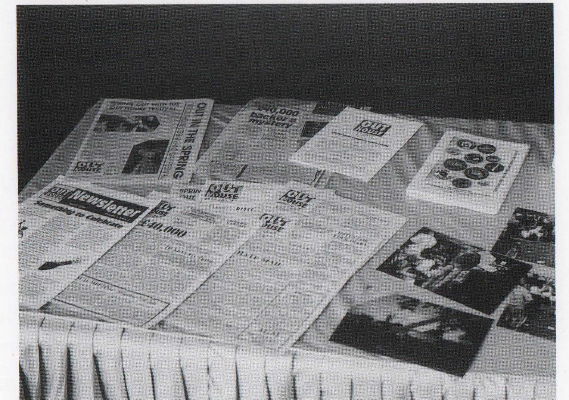
Part of the History stall display at Nottingham Pride 2000

A very successful triple stall displayed various historic artefacts at this year's Nottingham Pride at Victoria Embankment. Using our own gazebos and display materials the event attracted a lot of interest and brought several new people into the project.