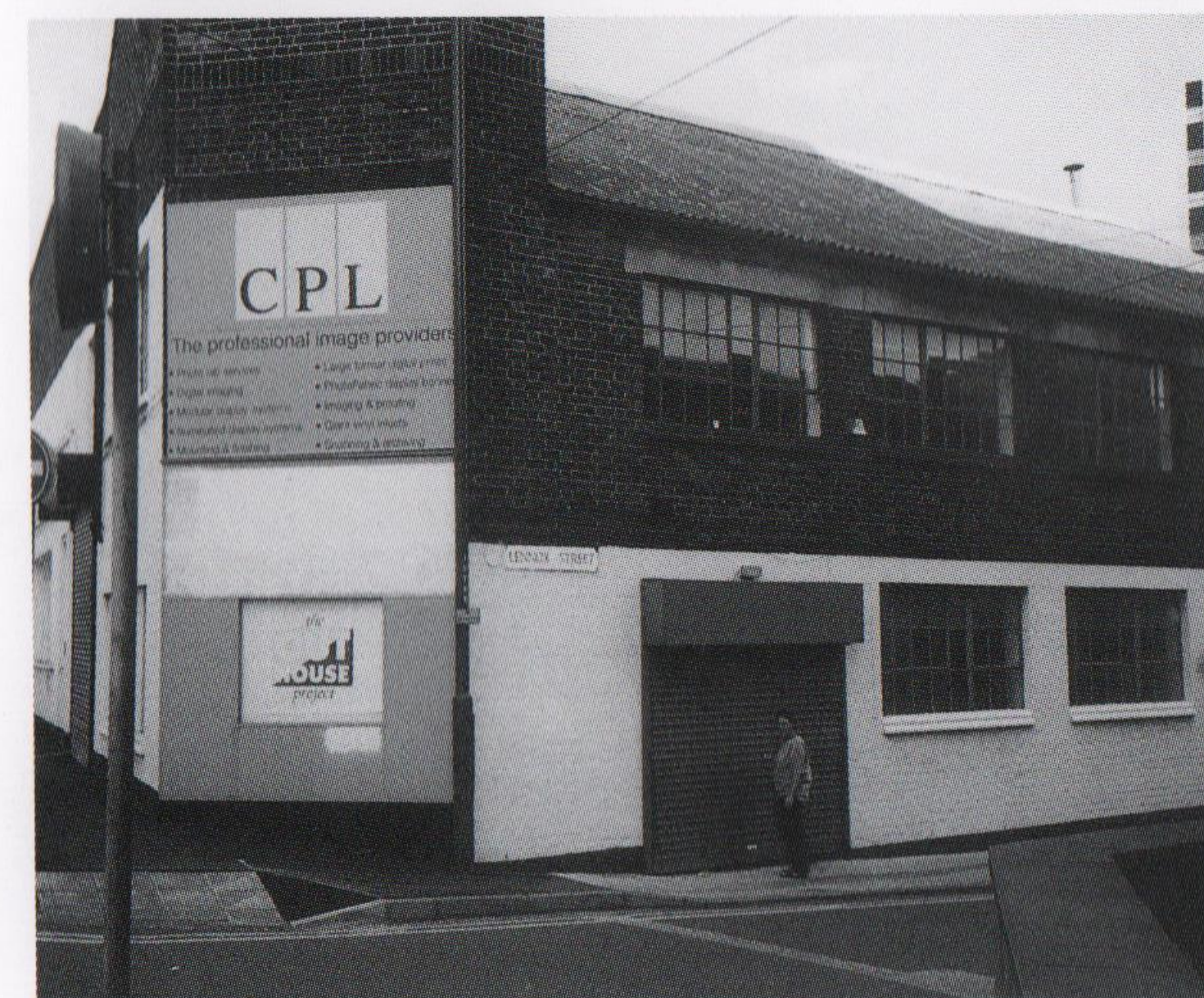
Side view of the building before work began

Meanwhile, in November 1999 we moved our temporary administration office to rented space at 40 George Street and this has provided improved accommodation. Committee members have given the room a springclean and repaint, and most recently installed additional furniture acquired from our neighbours. For the time being this is the powerhouse of the Out House Project.