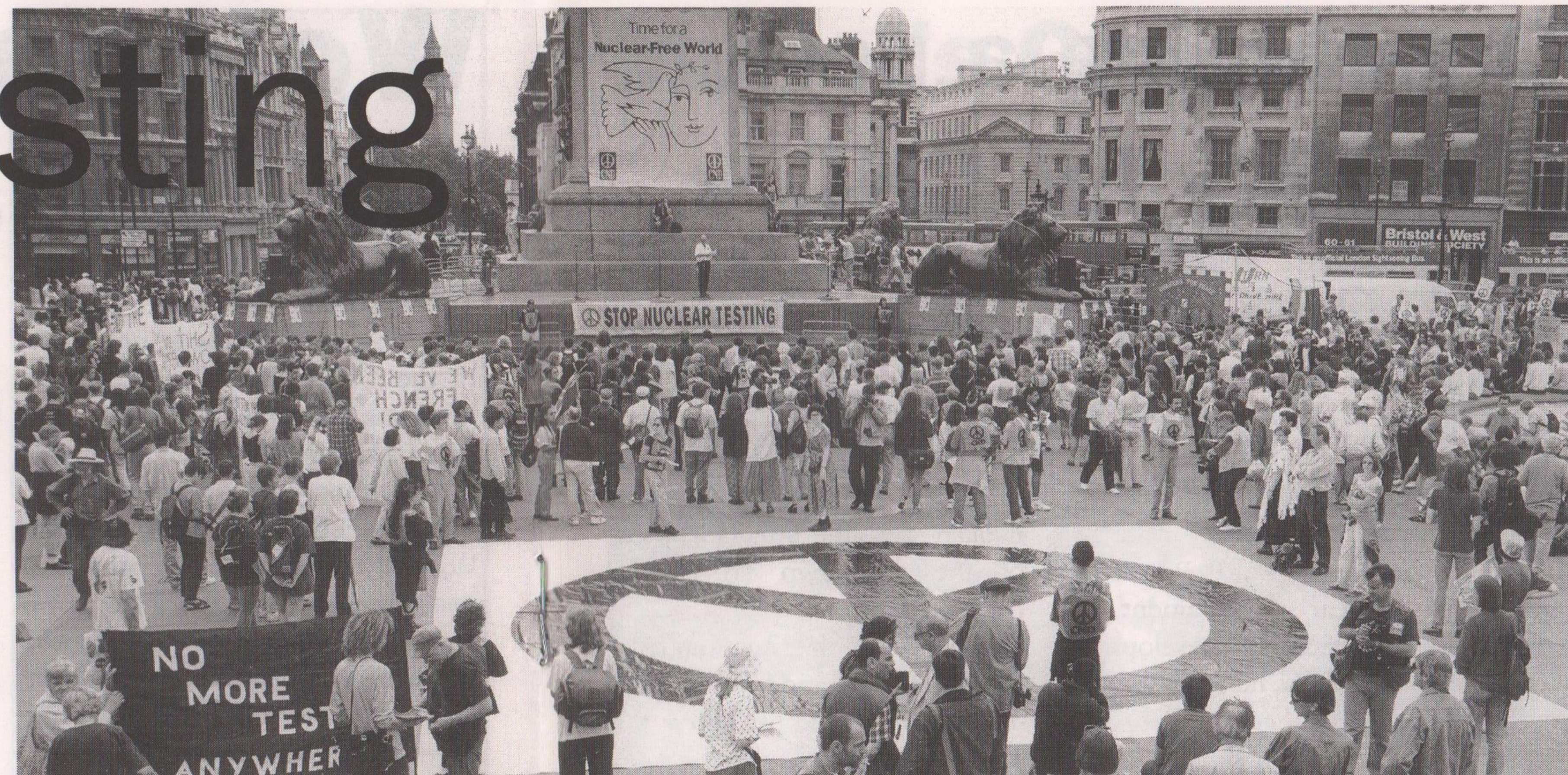
CND demonstration 16 July '95 – 50th anniversary of the first-ever nuclear test

The US Department of Energy has announced a programme of six "sub-critical" nuclear tests. The first test codenamed Rebound I is scheduled to take place on Tuesday 18 June and will be followed by a second test, Holog I on