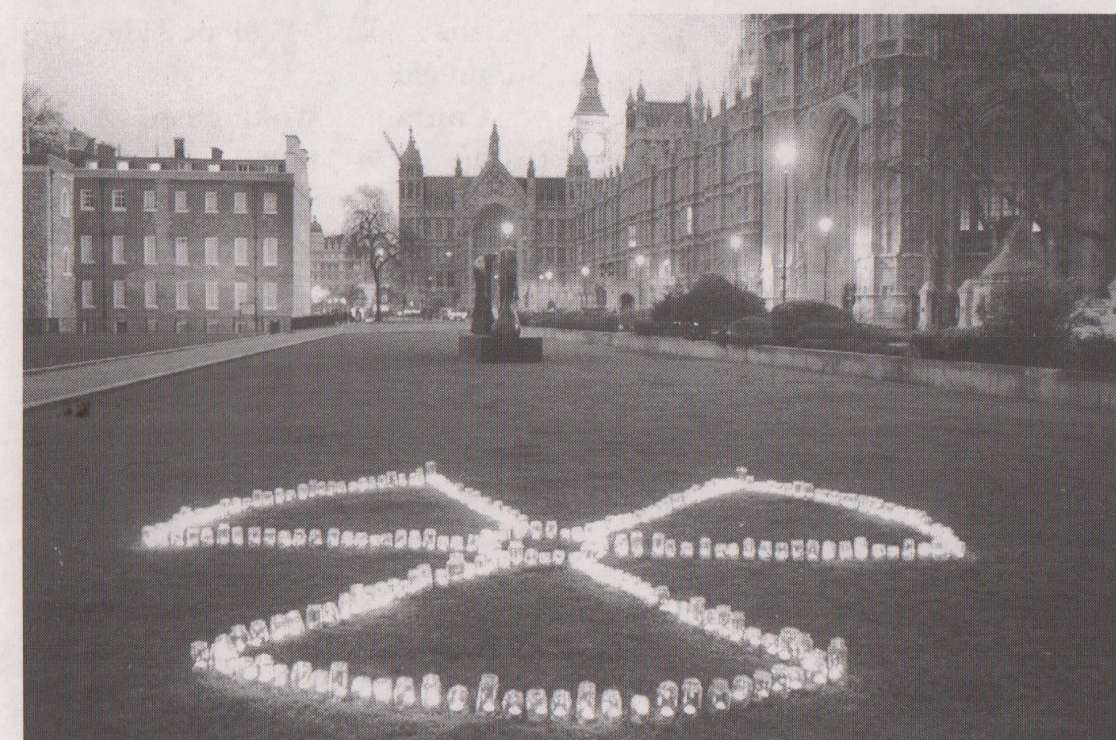
CND commemorates the tenth anniversary of Chernobyl with a candlelit radiation symbol outside the House of Commons.

Many groups have been concentrating their activity on the tenth anniversary of Chernobyl and have worked out a number of ways to attract publicity.