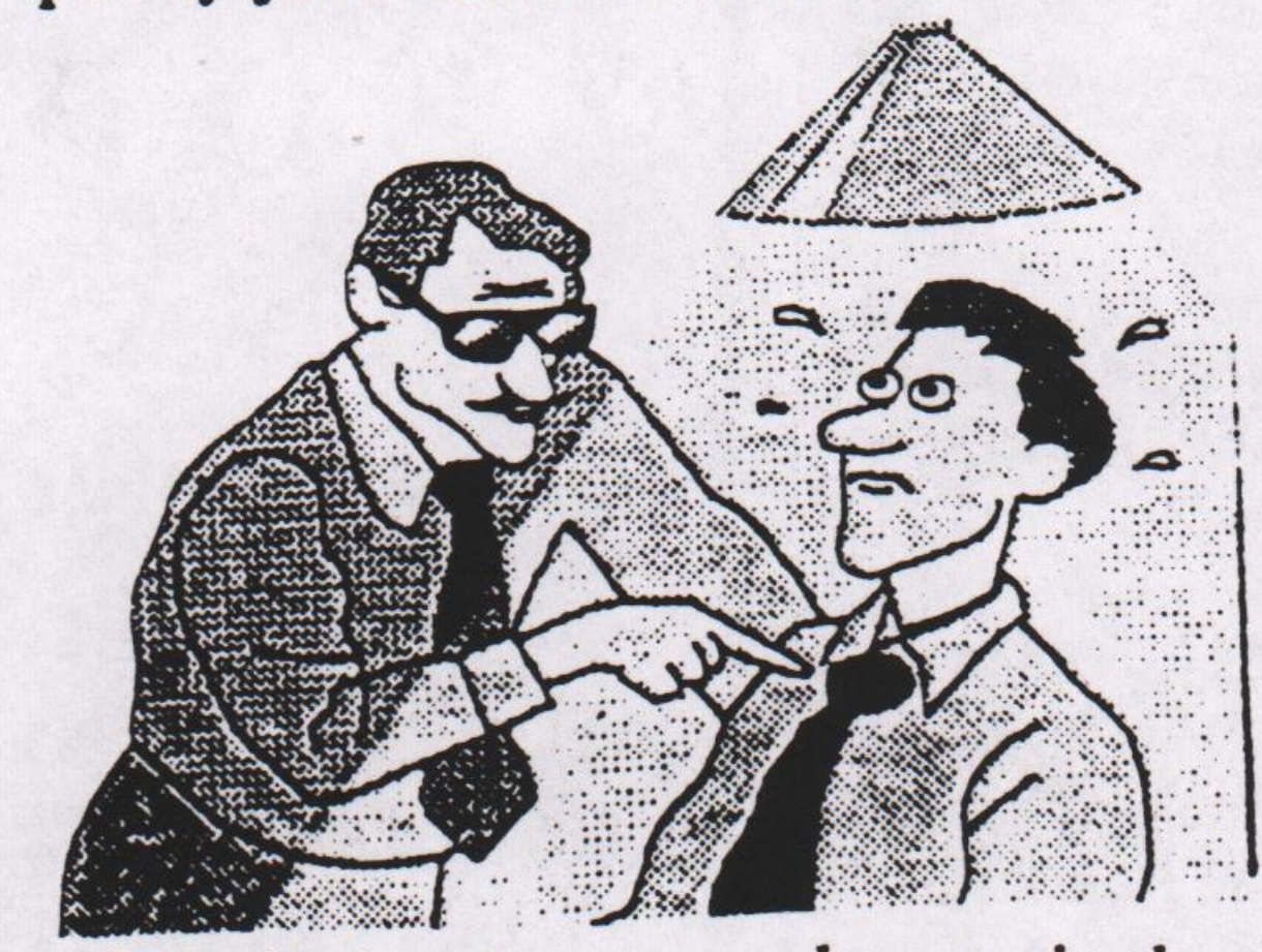
"And what have you done to look for work this week?"

MUWC will continue to campaign for quality jobs and better benefits.