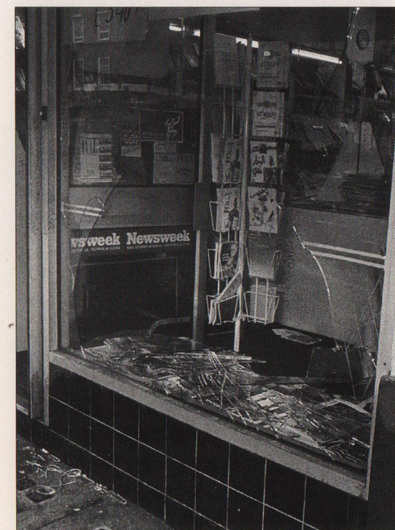
Damage caused by racists in Britain, a reminder of the German Nazis' Kristallnacht in 1938, when Jewish shops and premises were smashed

The past year has seen a rapid growth in the demand for us to supply information and speakers on racism and fascism. Working in conjunction with respected bodies such as the Spiro Institute (part of London University), United Against Racism, a body set up and supported by the European Union, Amnesty, and the Council for Education in World Citizenship, we have reached thousands of young people in Britain and across Europe. Searchlight's youth workers are highly respected and used as advisers and trainers in combating the evils of racism and antisemitism.