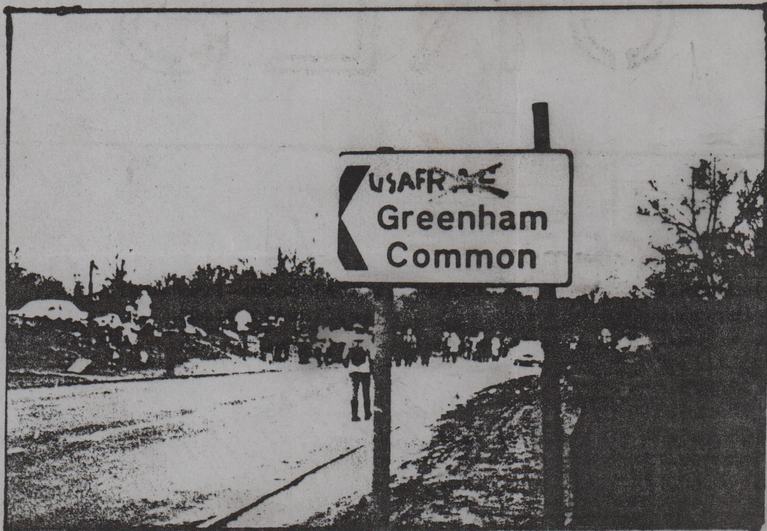
The fact about Greenham Common the Govt. tries to ignore. USAF stands for United States Air Force....