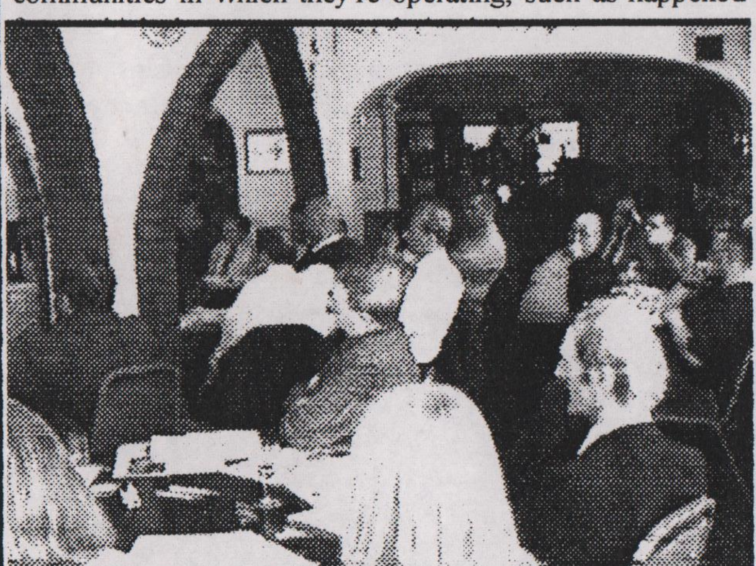
(Above) Midlands BNP organisers meeting;, October '98.

All in all they've been surprisingly patient with their tactical shift, particularly considering the fact that the former National Democrats Black Country branch is thriving with both resources and numbers. This reflects a greater political maturity than previously shown - like AFA, in the absence of immediate and consuming street activity they're learning to operate with a better long term perspective. The Black Country branch alone has enough members to hold "public" events and, with a little help from the sensationalist media, create a wave of public hysteria. They will continue to exploit media negligence and gullibility, but they will not foolishly expose themselves to AFA attack (In December Worcester BNP, apparently acting on a regional initiative to generate a press "splash", announced a meeting via a well covered press release. this turned out to be nothing more than a closed branch meeting). If Redditch is to be taken as a reflection of tactics then they will box clever, until such a time as they have a mandate within the communities in which they're operating, such as happened in East London in the early nineties, and much of Europe - the templates