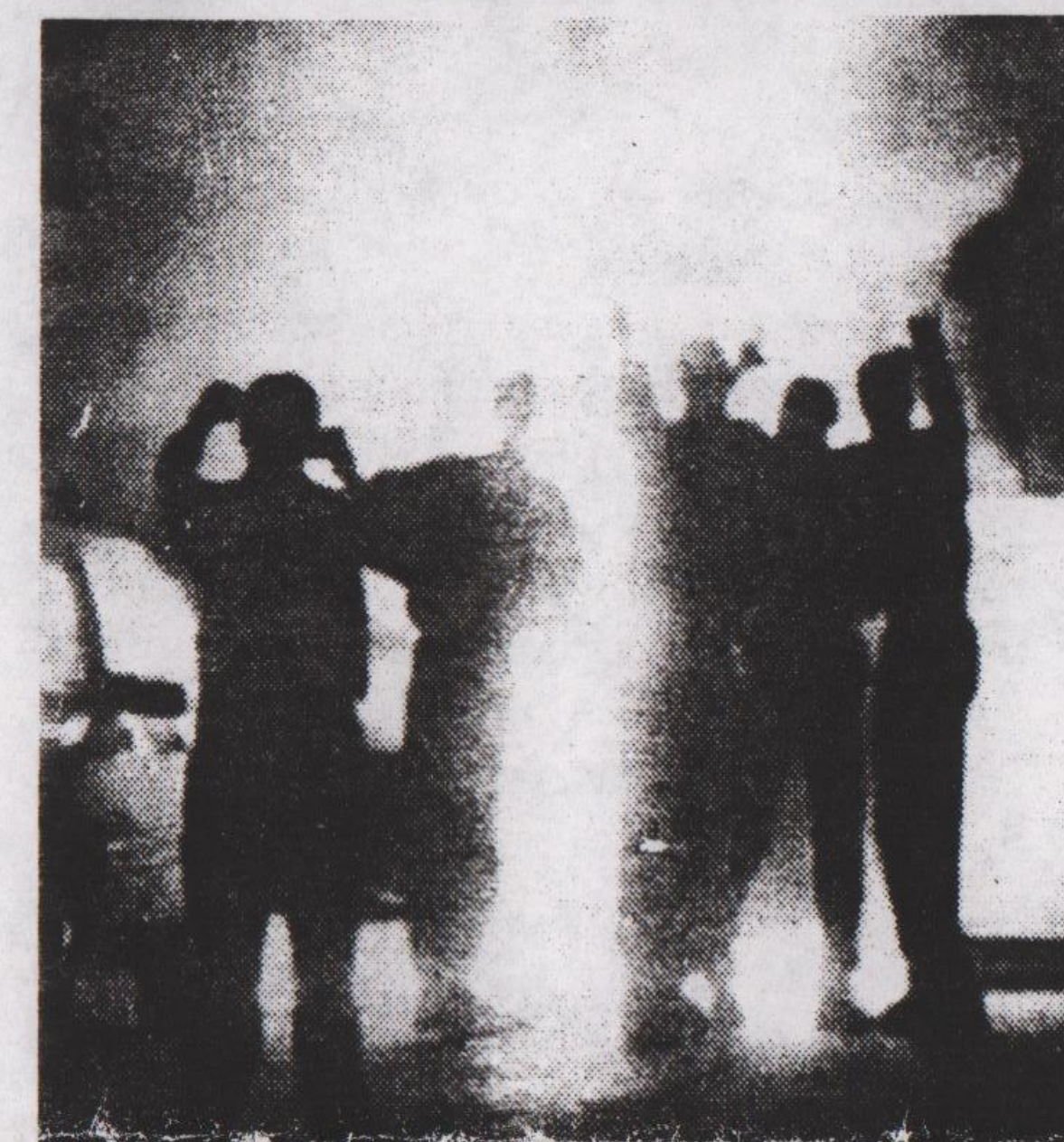
Nazis seig-heiling as Rostock hostel burns

have been distorted by fascists making multiple phone calls, nevertheless, the Republicaner have been making steady gains and, according to most prominent pundits, are certain to hold the balance of power in the 1994 general elections, forcing Kohl to form a coalition with the main opposition party, the SPD. This is perhaps an understatement of how fascism can leap forward in the present climate.