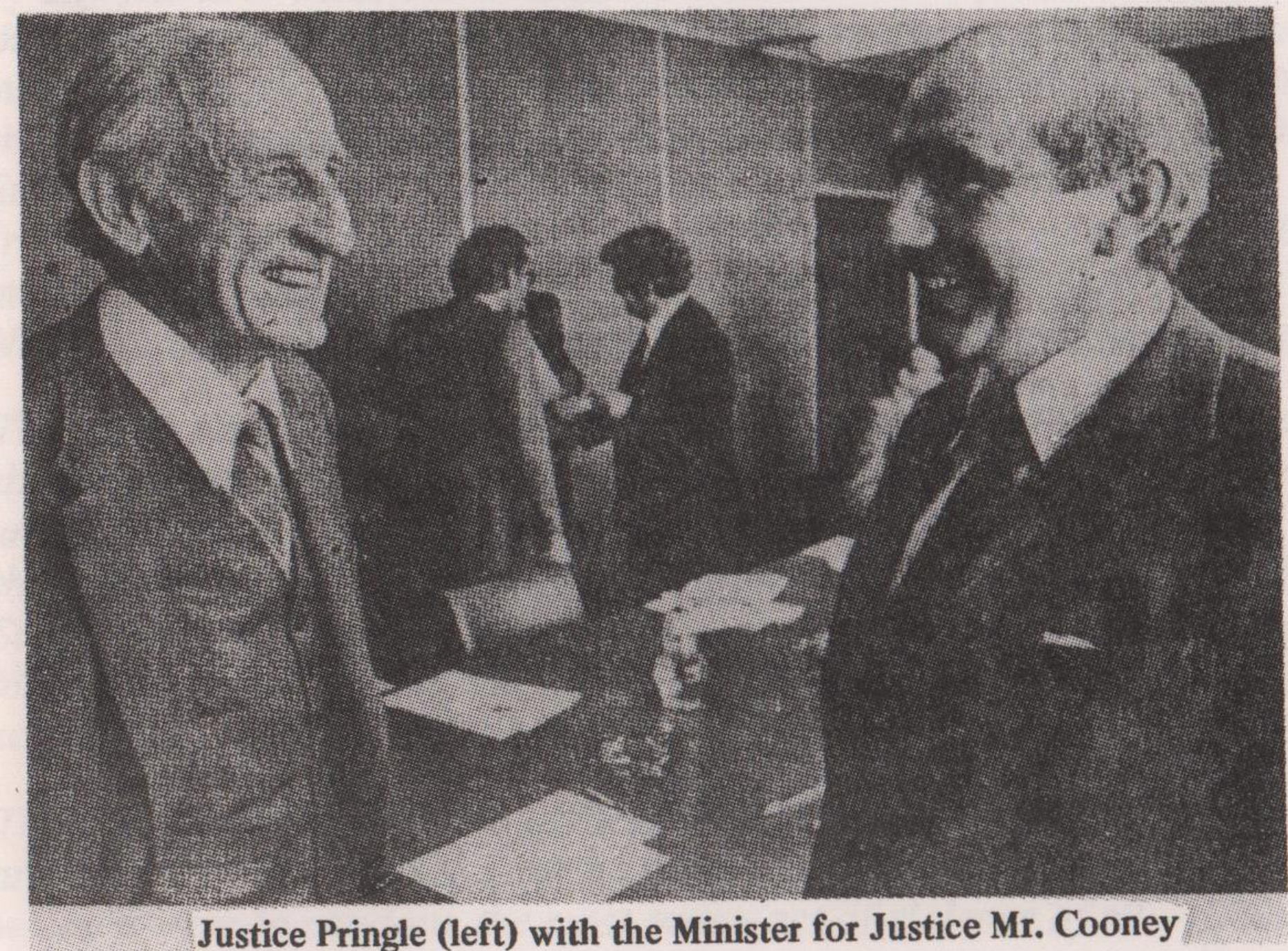
Justice Pringle (left) with the Minister for Justice Mr. Cooney