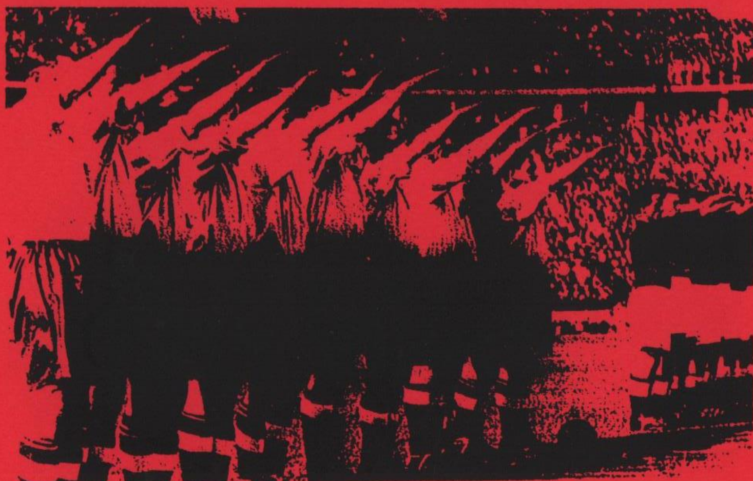
England's footballers giving the controversial Nazi salute before playing Germany in Berlin in 1938. It was excused as being 'a local custom'.