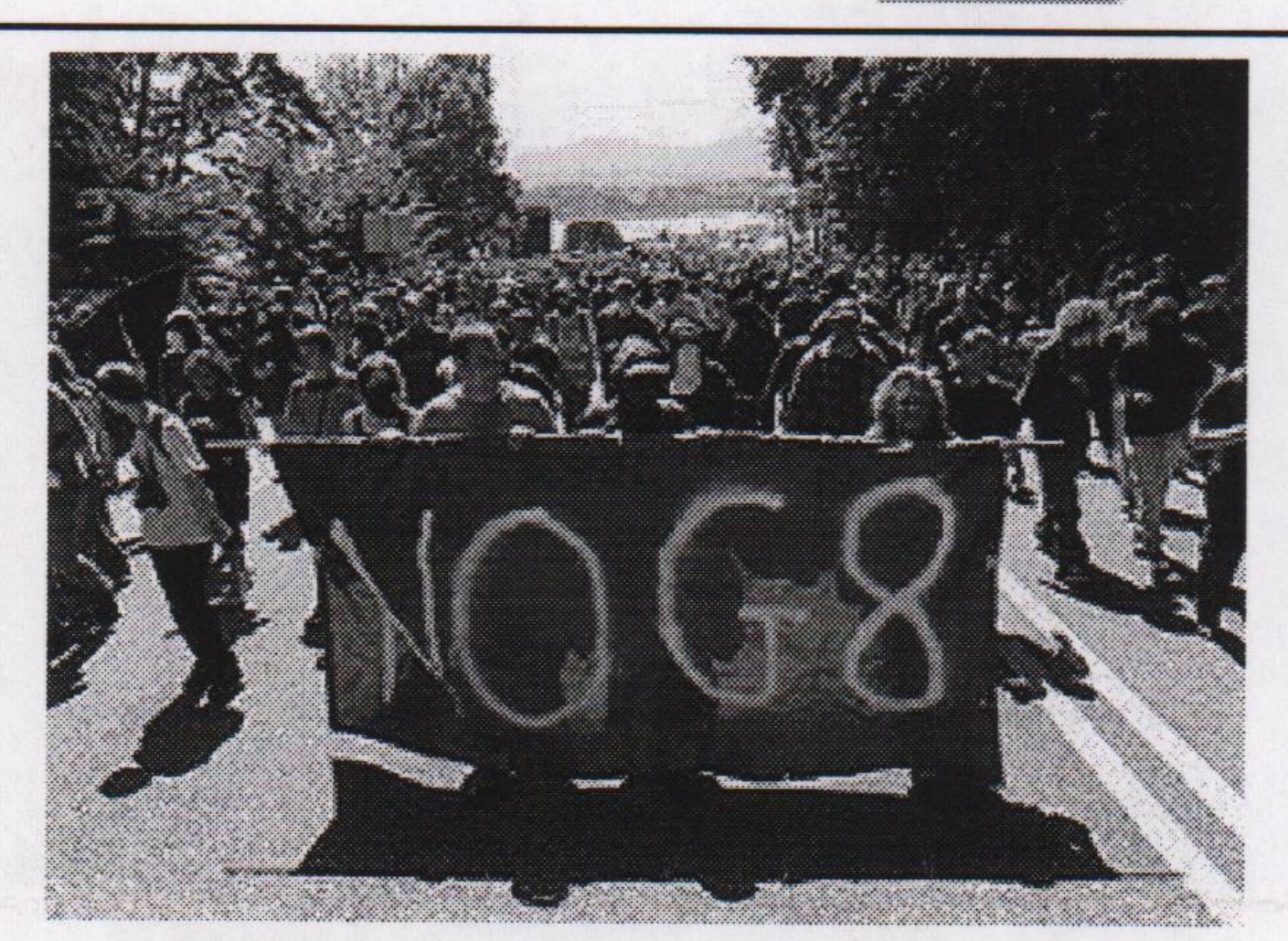
Part of the protest against the G8 summit at Geneva, May 30th, 2003