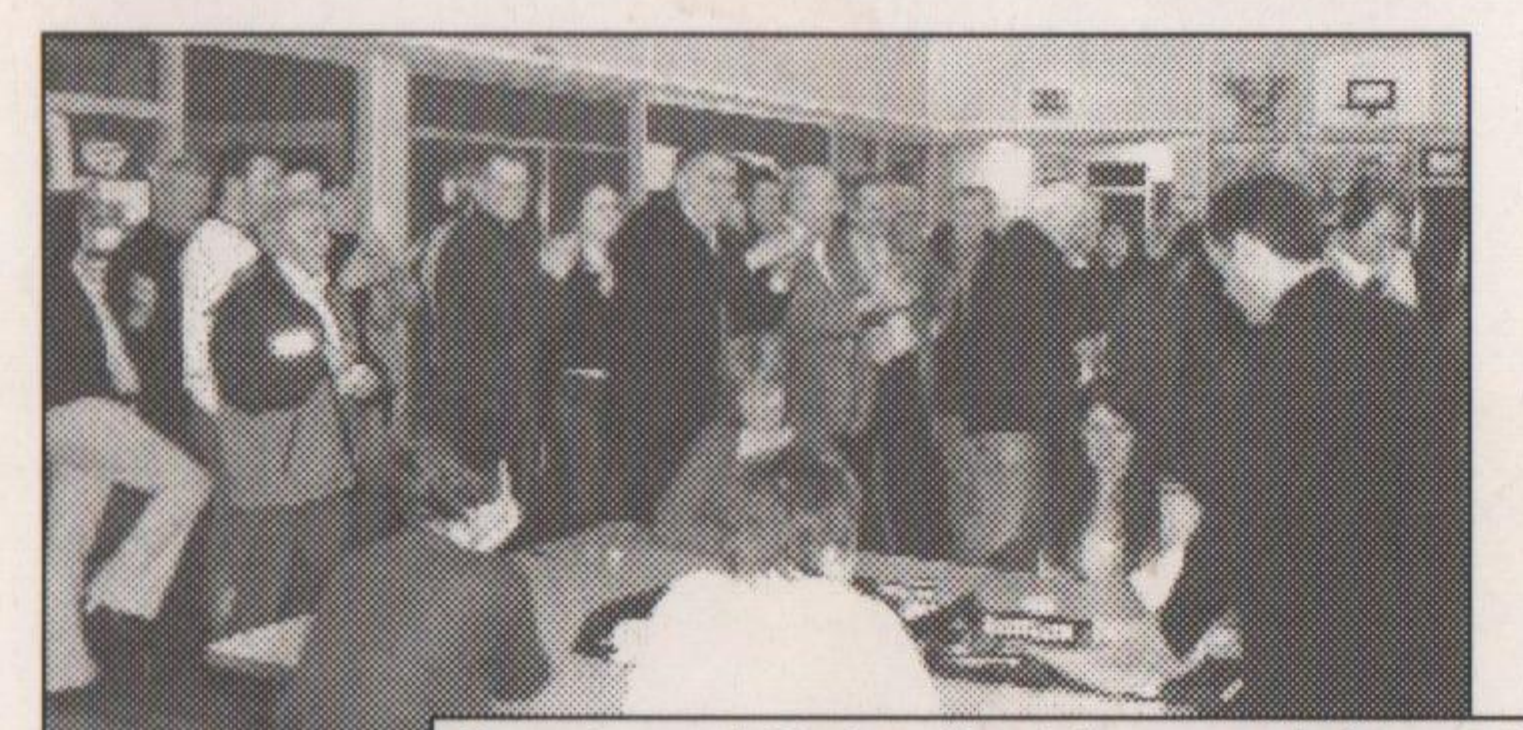
Overjoyed Paicr Residents celebrate Land Reform Act success

South East of Uist, Crofters have called on the Cairngorms National Park to renovate their empty Crofts to satisfy local demand for affordable homes. Crofters in Badenoch in the Cairngorms are being offered high prices for scarce grazing land by housing developers bewitched by planning gain: the rise in land value that comes