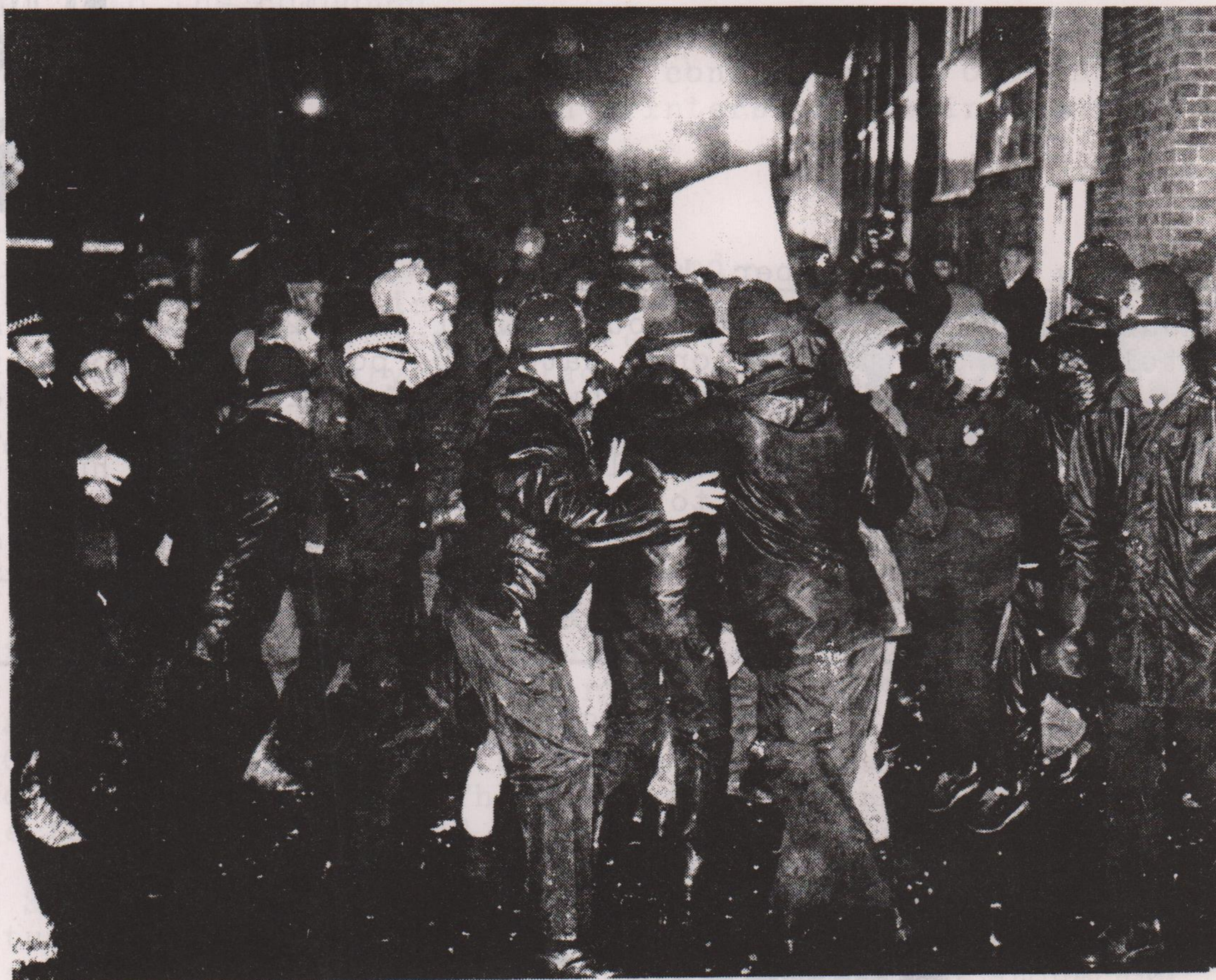
Early on picketing in Bristol

Western Webb Offset used to print Murdoch's News of the World at a factory off Bath Rd. in Bristol until flying pickets from Wapping stopped one whole delivery losing them the contract. This was well over 2 months ago so it's old news, but when somebody found another disused building of theirs it seemed an ideal place to squat for a benefit towards the printers struggle.