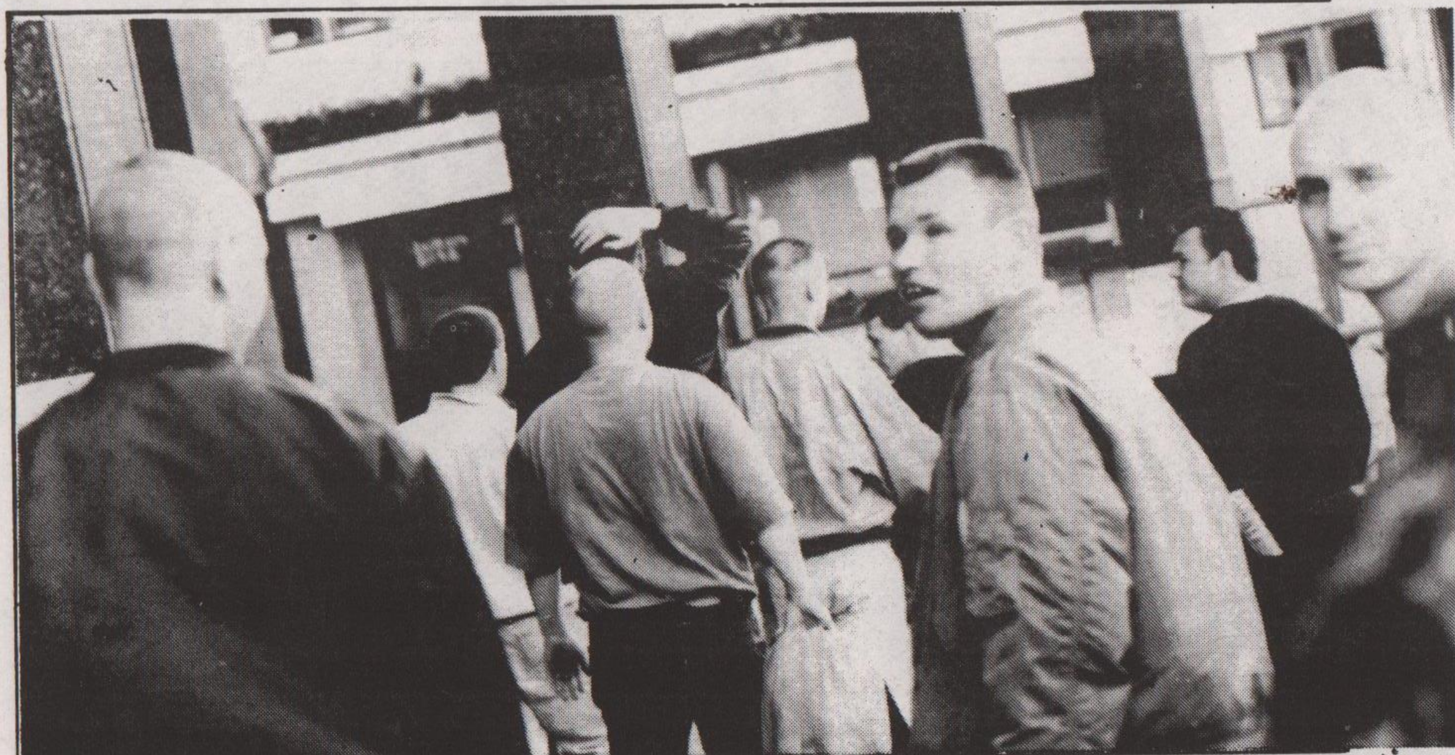
FASCISTS FLEE' FROM THE BATTLE BEFORE THEM.