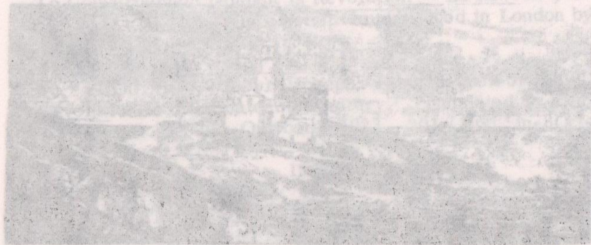
December, 1926? 72pp, in-8 Octo.

45. KROPOTKIN, Peter: Revolutionary Government. June, 1923. 16pp, in-8 Octo. (Freedom Pamphlet). Translation of 'Le Gouvernement pendant la Révolution - 'La Révolte'', 1882.