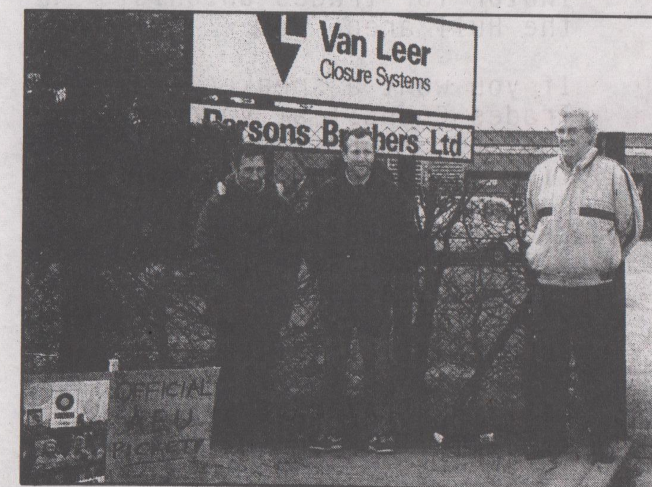
ON STRIKE: The picket line outside Parsons Brothers Ltd.

Speakers and further information are also available from that address.