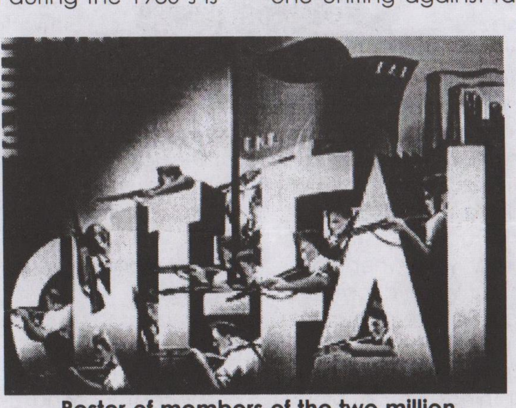
Poster of members of the two million strong anarchist organisation CNT-FAI

advised to give this particular collection a very wide berth. The struggle of the revolutionary workers movement in Spain was fundamentally anarchist in nature. Two million people