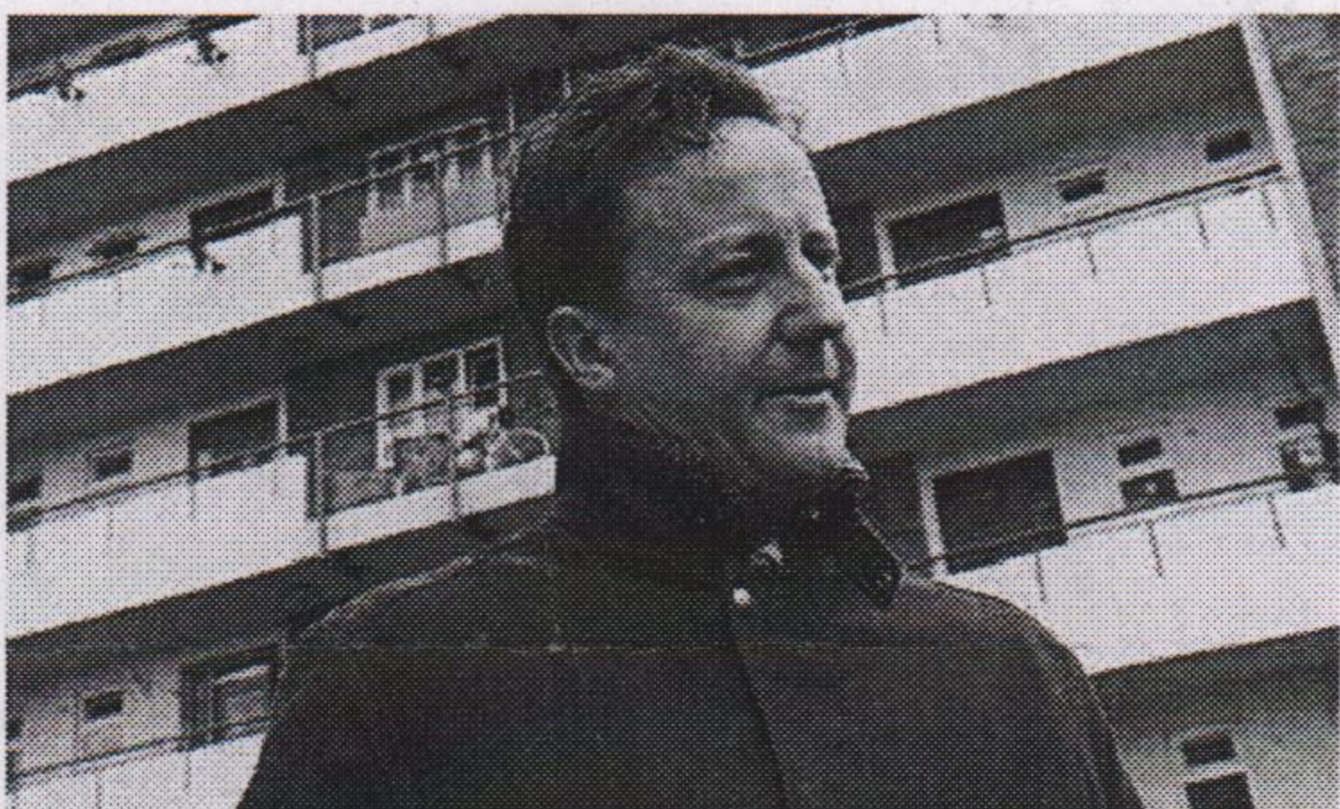
Citizen Cameron: Power to the people?

Prime Minister David Cameron recently came to Liverpool to unveil his "Big Society."