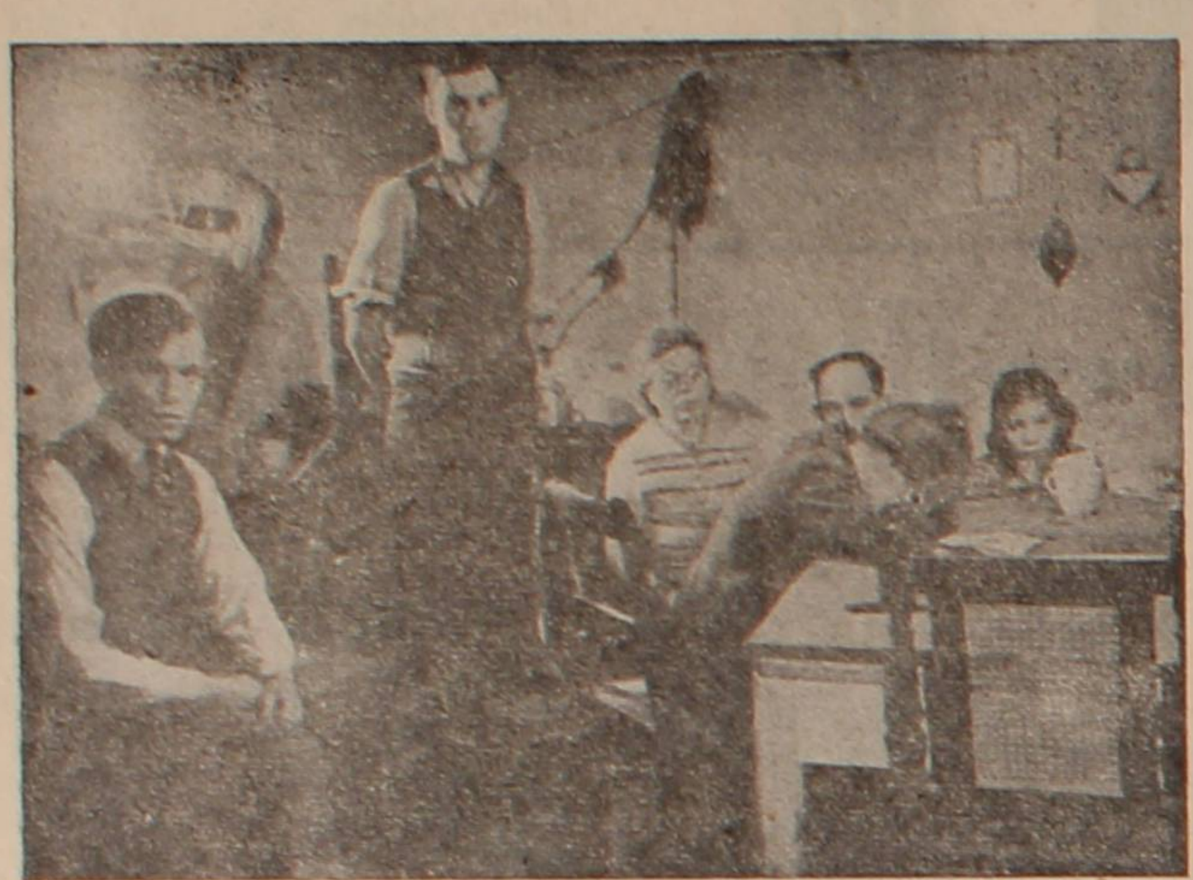
People live in cellars and under rubble. The average living space in Dusseldorf is just lipsticks, lengths of tweed (blue, gray, over 3 square yards per person.

the last issue of Freedom much has been Office Savings Bank. said in Parliament and in the Press which To have an idea of the profits made by rate, £200.