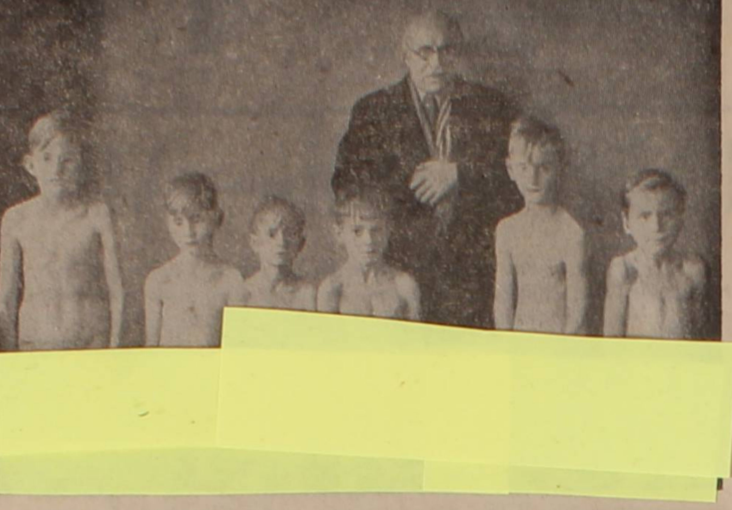
Gollancz found schoolchildren hungry, underweight, suffering from skin diseases.

market transactions are taking place when rule of the strong.