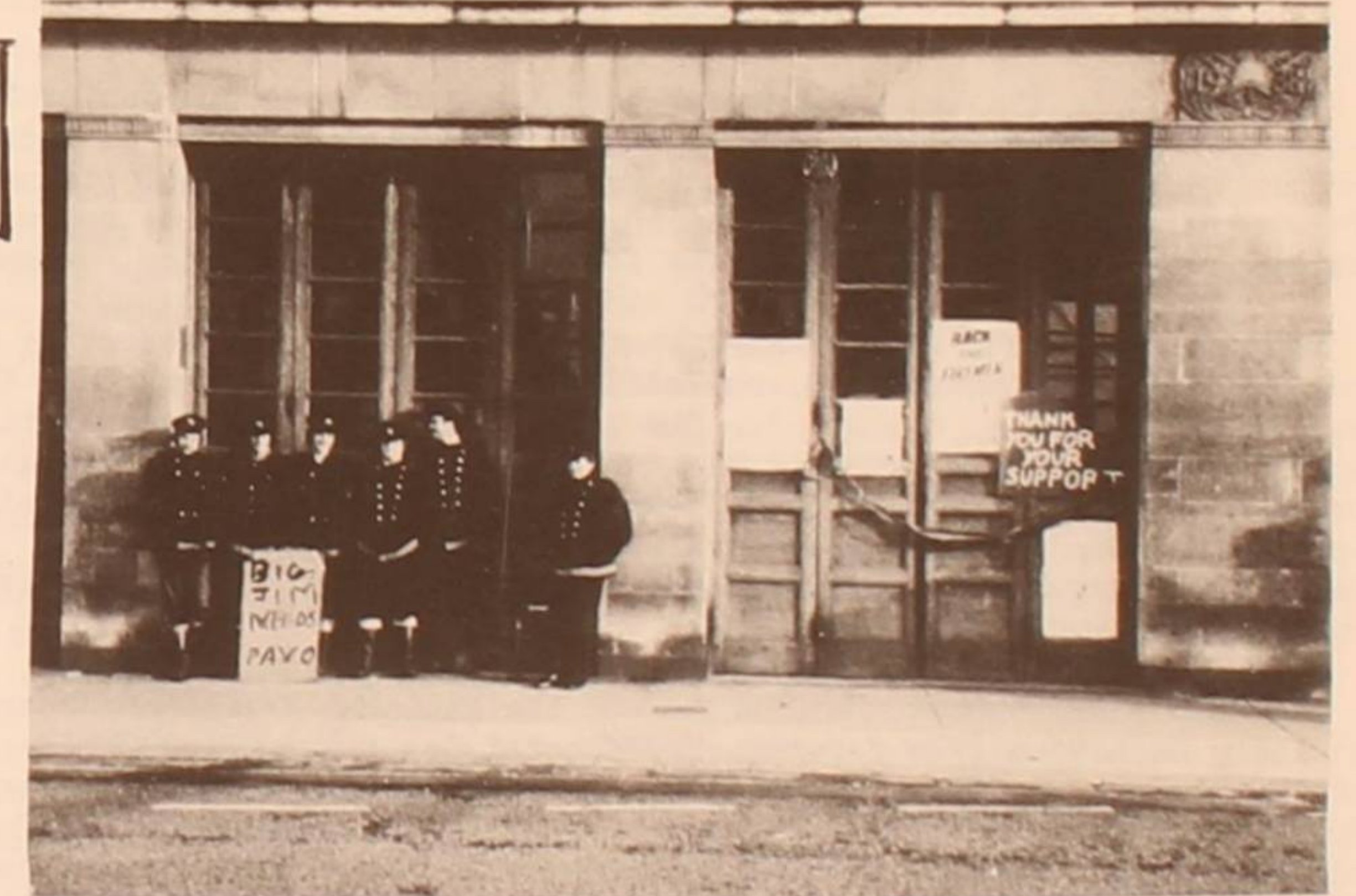
BRIGHTON FIREMEN ON THE PICKET LINE

Firstly we must thank the public for their help in the battle, without you we would feel lost and lonely. Public opinion is with us. We handed in 1/2 a million signatures in London and we could do the same this week, but who will listen?