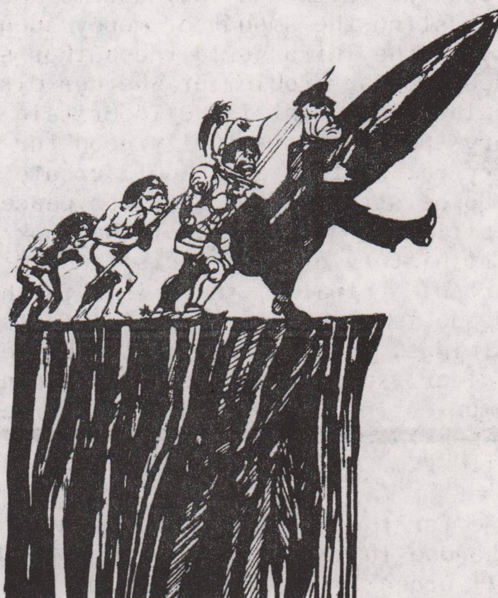
The Unmaking of Mankind: 3 million years of evolution to produce . . . the short haircut

We sometimes receive complaints about the social events which are arranged. It isn't easy catering for such a wide age and taste range. If you have any suggestions, do let us know.