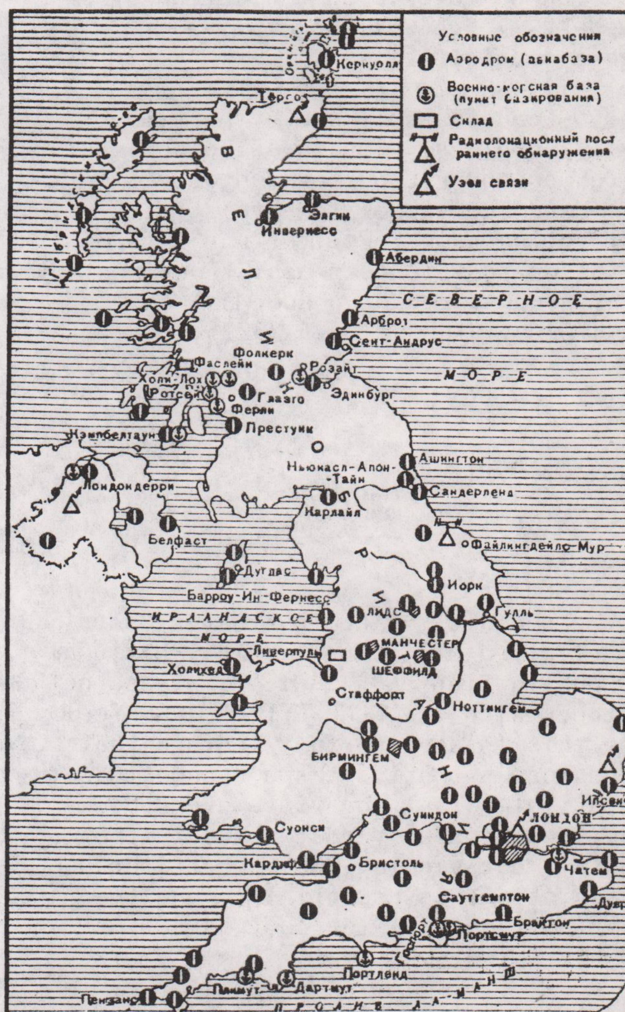
A Soviet map, published in 1980, showing military locations, both British and American, in Britain

Wanted: A typewriter. Any would be acceptable, though we'd love to get a carbon ribbon typewriter. Phone the NCND Office 582561.