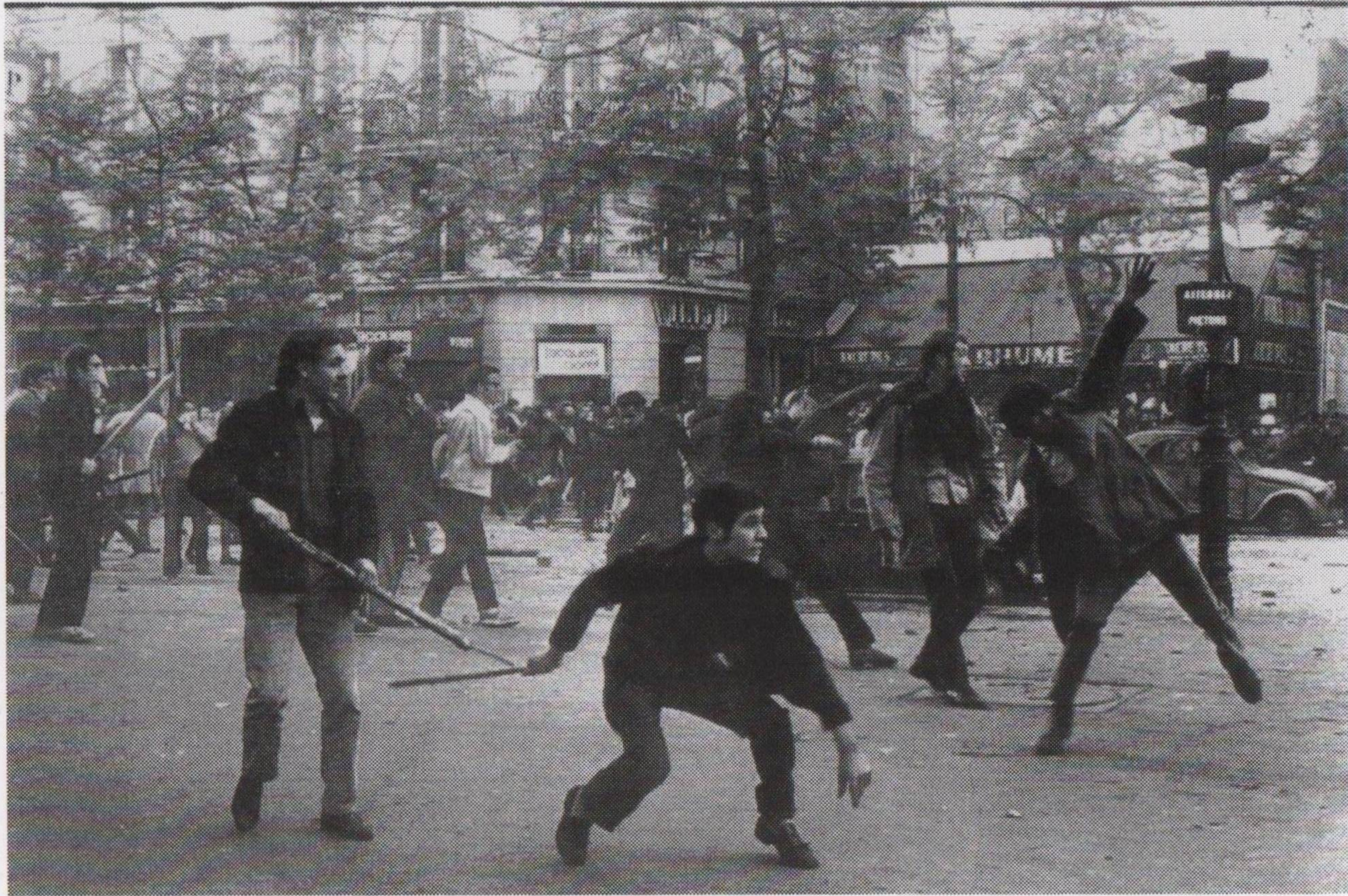
FRENCH STUDENTS FROM '68 COULD TEACH TODAY'S GENERATION A THING OR TWO

A ccording to popular belief, everybody hates students, with the possible exception of brewers. Spoilt, lazy middle class brats sponging off the taxpayer and forever whinging about how skint they are. Selfish, arrogant idiots having a three year binge at public expense before sliding neatly into a highly paid job somewhere bossing the rest of the world about.