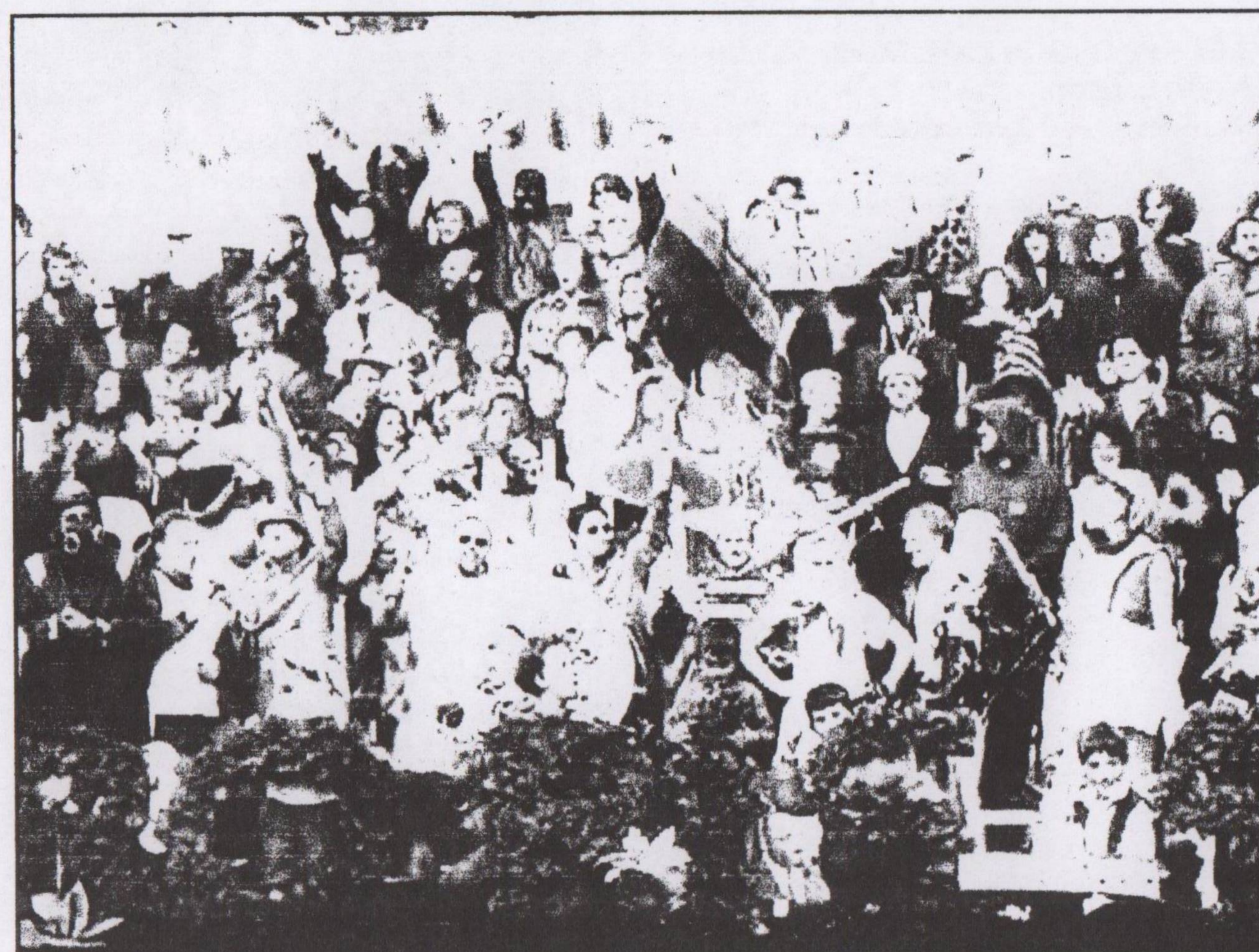
The April 30th protest against the terrorism bill. More info contact the A30 group, c/o Dept 29, 255, Wilmslow Rd, Manchester, M14 5LW. http://drink.to/dissent

We are still trying to get details of all of the Italian militants imprisoned recently. At the