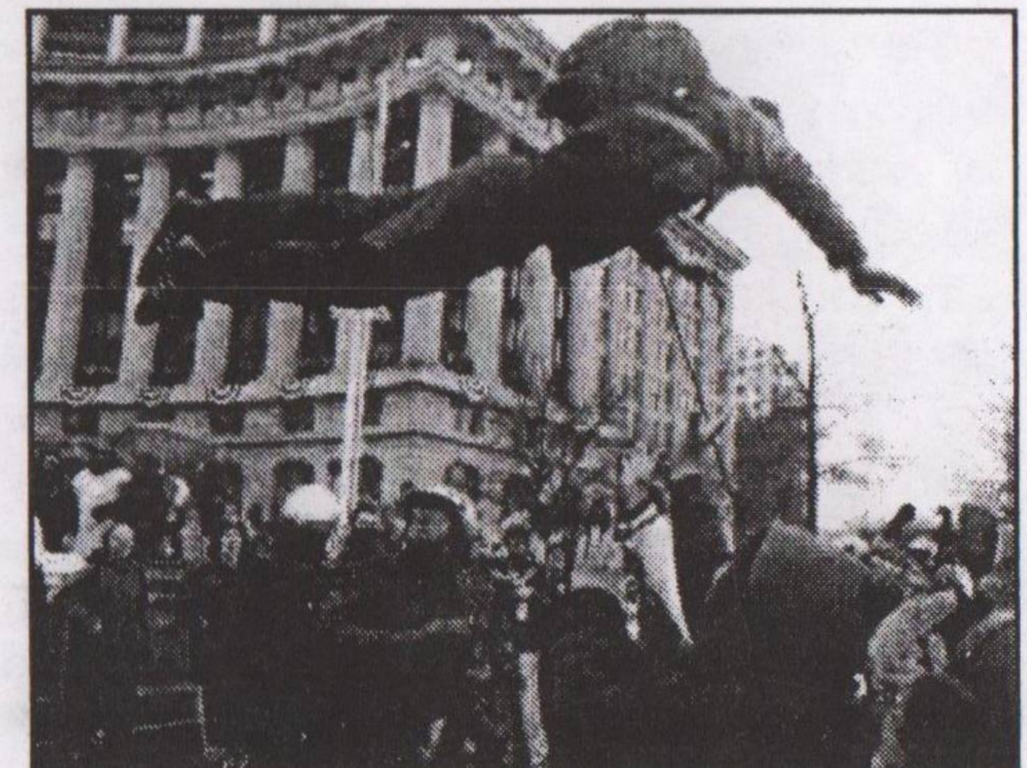
The anarchist black bloc parachute regiment encounters some teething problems