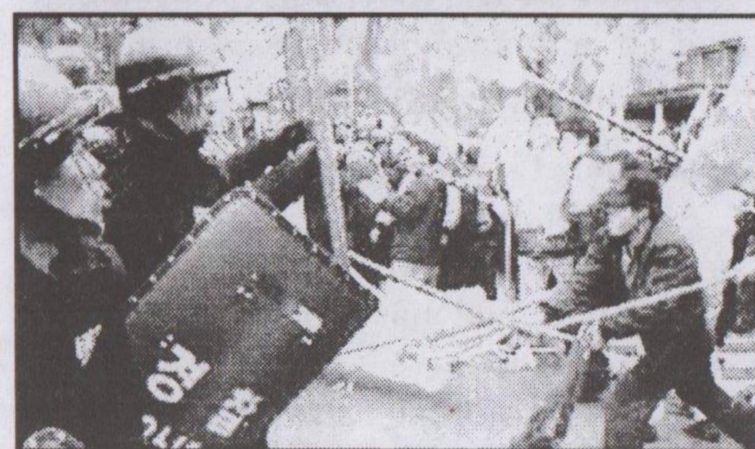
Korean Farmers protest against the WTO

ON 13th Nov demonstration against the World Trade Organisation meeting took place around the world.