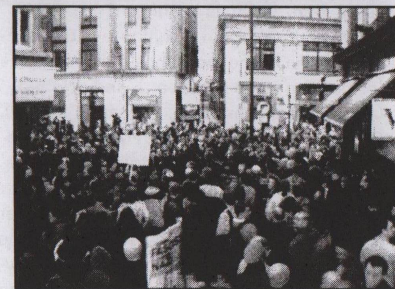
Mayday in Mayfair

Meanwhile, the Trotskyists of the SWP, through their front organisation Globalise Resistance (surely that's Demobilise Resistance?) had entered into an alliance with trade union bureaucrats and Stalinists for yet another boring demonstration marching from A to B. The most recent Maydays, for all their faults, were an attempt to get away from