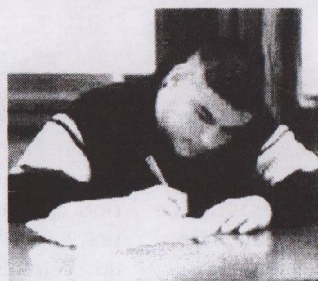
Exams fail us

The government would like to go further in controlling the teachers by introducing performance related pay. Another use of exams is that they force young people to constantly think about "achievement" and "success". They compete with other students, and those who work hard-