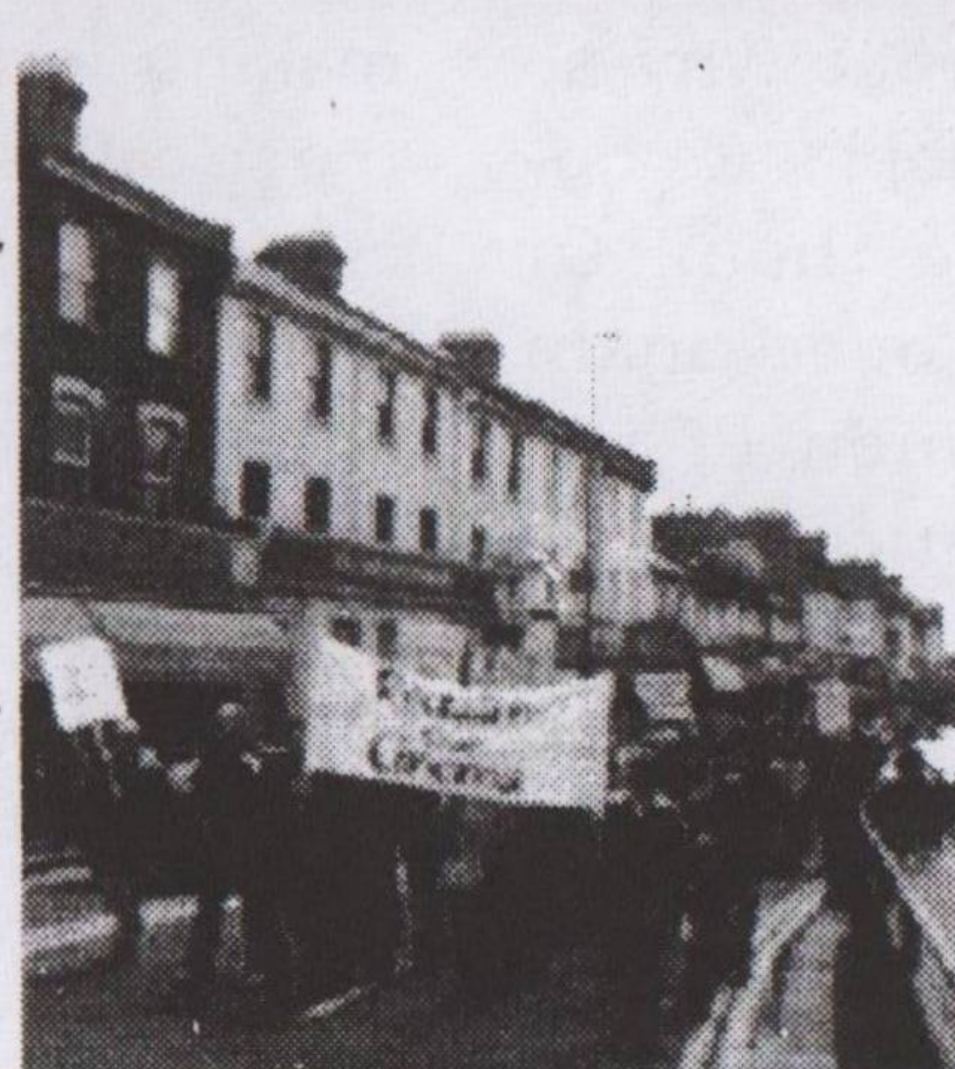
Reclaim our cinema march

Knowing that demonstrations can get a bit boring, the godheads had travelled all the way from Finsbury Park to lay on some sounds, with a choir of 200 and a sound system blasting out hymns. Locals didn't seem too keen on the UCKGers whose raucous singing and pavement blocking was an unwelcome taste of the Kingdom of God on earth. Ironically, the church members whose counter protest was to ensure that the cinema would be-