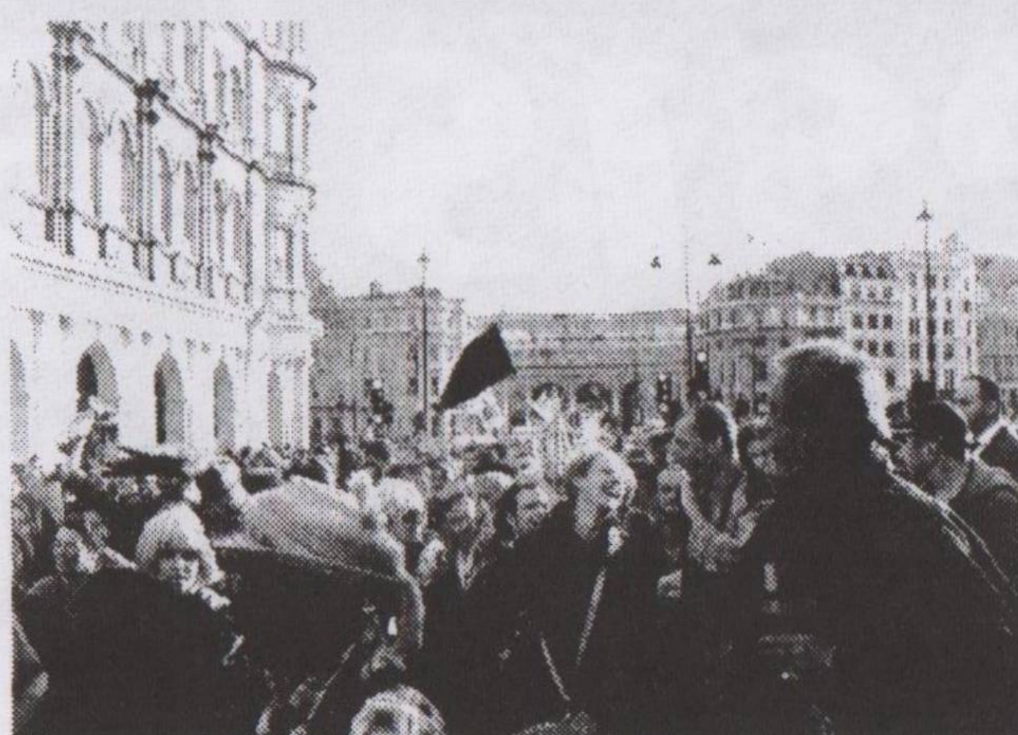
Mayday in London

To make anarchism a threat to capitalism and the state we need strategy of building up our strength and the long-term commitment to follow it through. Amongst other things, members of the Anarchist Federation (AF) have recently been making the effort to build anarchist groups locally and have already seen success in Walthamstow, Herefordshire and Surrey. The AF works to build anarchist