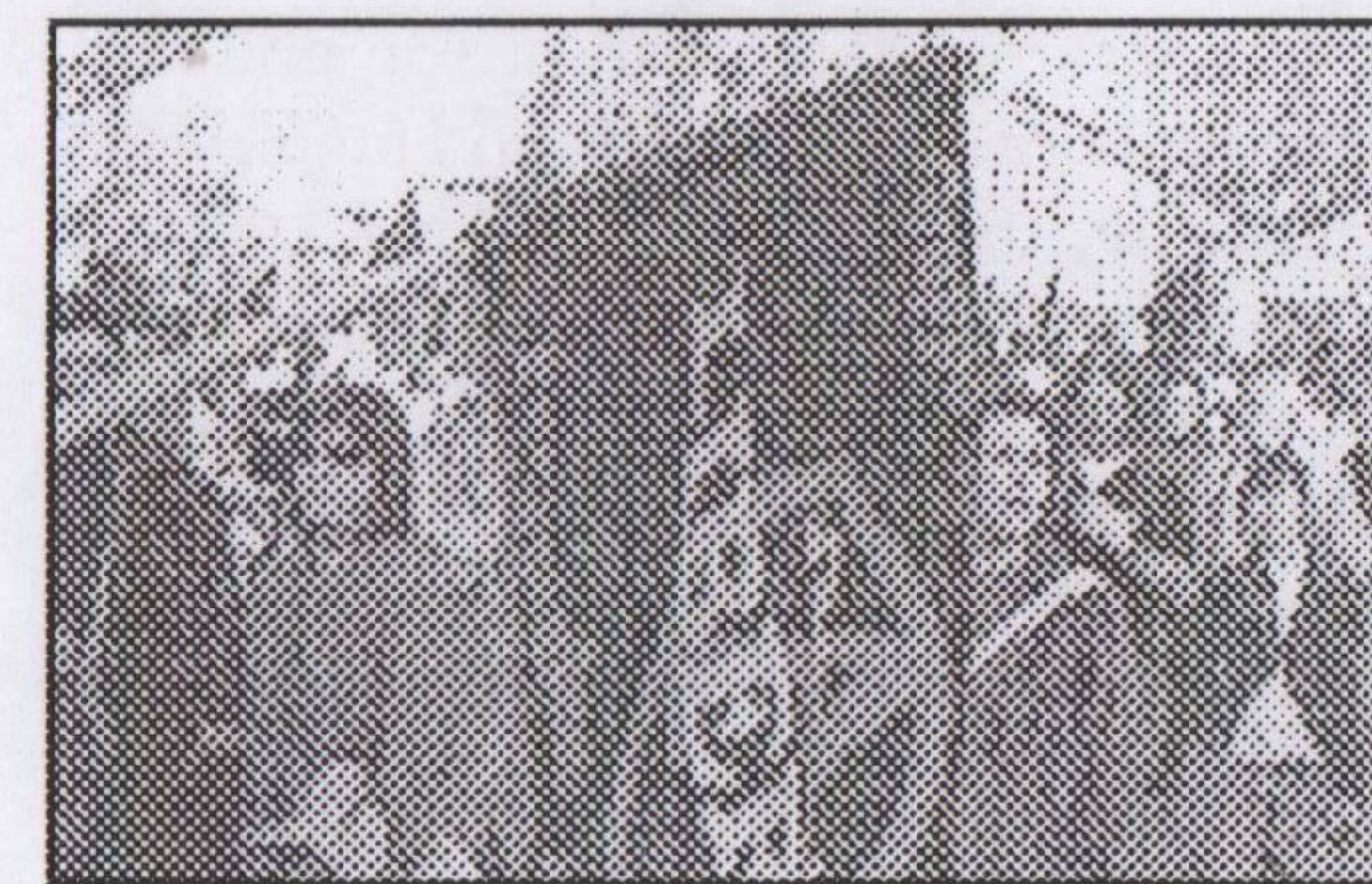
Anarchists marching in Italy

Our aim was to highlight the fact that the world is now facing a situation of "permanent war", which must be resisted both locally and internationally.