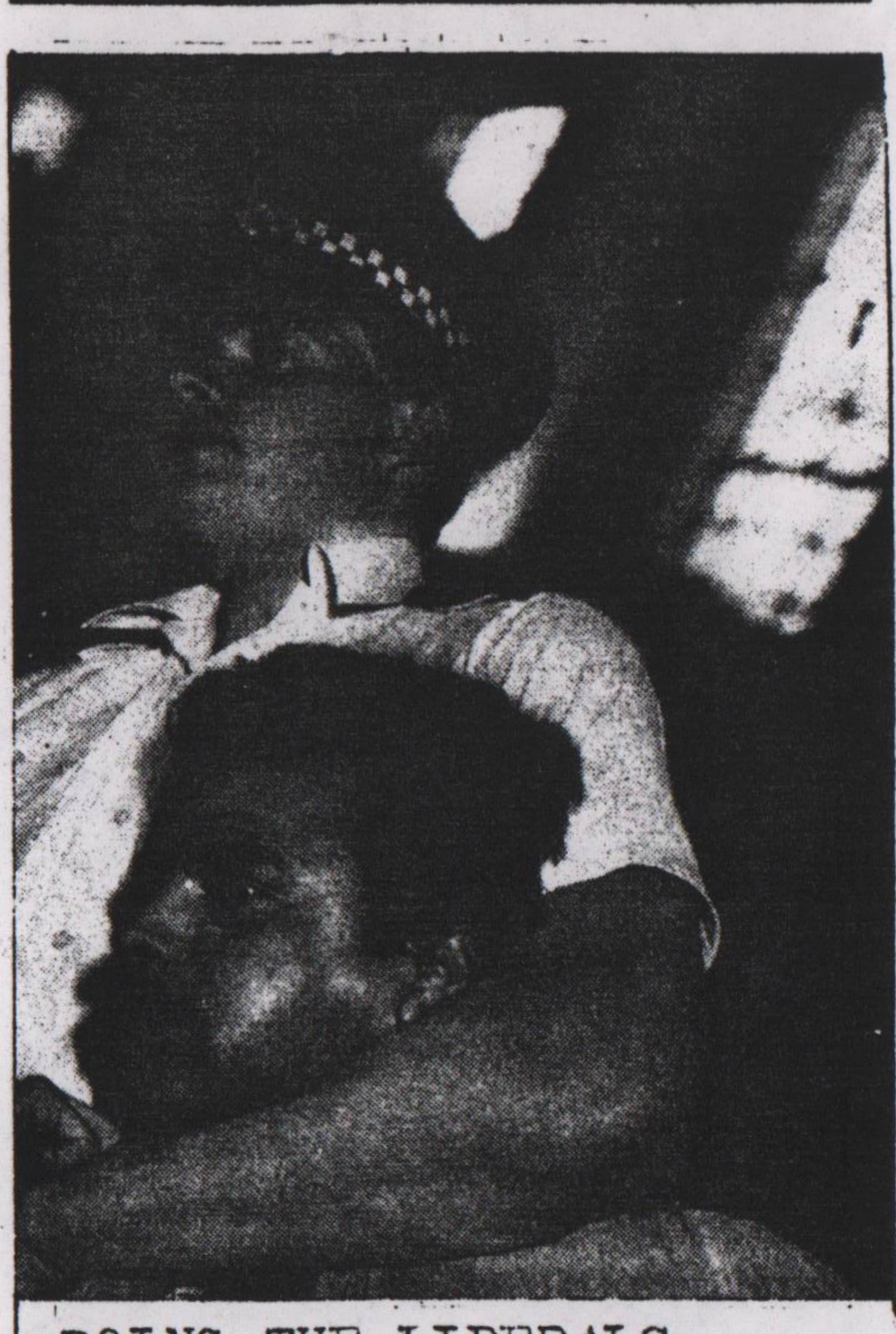
DOING THE LIBERALS DIRTY WORK...POLICE CLEAR PROTESTORS FROM A COUNCIL MEETING AT TOWER HAMLETS TOWN HALL.