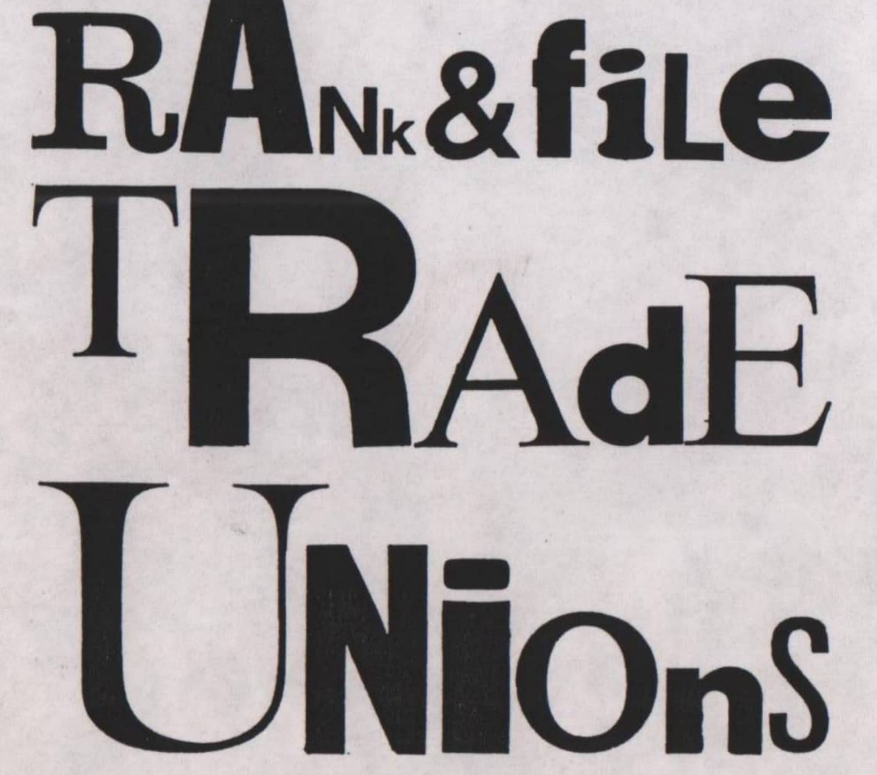
ILLUSTRATION FROM 'SAC KONTACT' PAPER OF SWEDEN'S RANK + FILE TRADE UNION